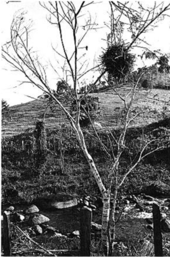
FIG. 3. Nest tree of Phacellodomus r. rufifrons isolated in a field near Arataca, Bahia. Three nests are visible. Vertically oriented, pendant nest on lower left of tree is typical of an active nest. The two spherical, nest-like structures built around limbs are superficially similar to nests of Acrobatornis .

dropped at least some of their leaves in October, made it easier to see nests in them than in many other trees. To test this, we searched carefully in various kinds of trees shading cocoa and presented tape playback of A. fonsecai in parts of the serra Bonita where no nests were obvious. This effort resulted, however, in the location of only one nest tree, which turned out to be a Schizolobium parahyba (Leguminosae).