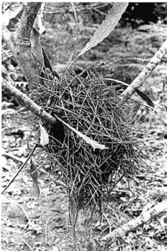
FIG. 5. Nest-like structure of Acrobatornis fonsecai , built around the fork of a rather heavy branch, with no entrance or chamber, and with an Epiphyllum sp. cactus growing out of it. This structure contained several small ant nests. We suspect that such nest-like structures, or "extra nests" of Acrobatornis might serve as dummy or cock nests, or as stores of sticks and building foundations.

outside edge, were 27 cm long and 3 mm in diameter (N = 4). These sticks seemed light in weight relative to their length, varying from 0.8–1.2 g.; the heaviest equaled about 8.5% of the body weight of the bird (about 14 g.).