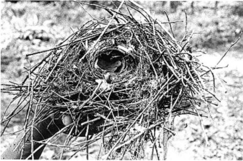
FIG. 4. Nest of Acrobatornis fonscai removed from nest tree shown in Figs. 1 and 2. This nest is missing the entrance tunnel, but shows the single, moss-lined chamber with its covering of twigs and sticks.

in the same line as the main axis of the nest) antechamber or entrance tunnel of undetermined length. We noted such entrance tunnels on all four active nests located, and numerous other nests, and concluded that it is a typical feature of active nests of A. fonscai . Entrance tunnels were always toward one end of the nest, usually the lower end if the orientation of the nest was other than horizontal. Bearing in mind that description of most aspects of the external, stick-structure of this nest are rendered somewhat inaccurate because an undetermined number of sticks was lost, we present the following observations.