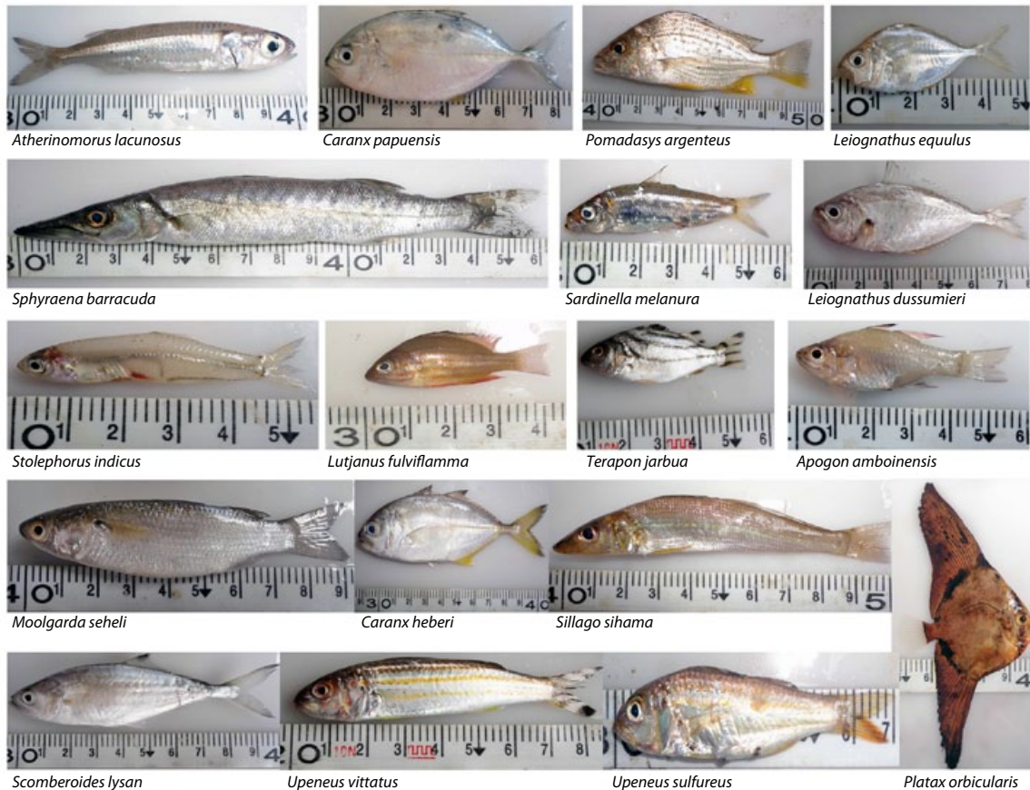
Examples of the various species caught on Mayotte's mangrove fronts (images: Rakamaly Madi Moussa).

As there is no major interaction, the loss of this habitat would most probably have no direct effect on the coral reef's fish population. However, on Mayotte, losing the mangrove could conceivably result in serious coastal erosion, and increases to water turbidity, earth deposits in the lagoon and, in the long run, changes to the coral reef population. Because of this, and as the mangrove is at risk, preserving the habitat could usefully be incorporated into coastal management programmes.