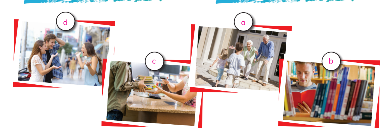
EXERCISE 4: Fill in the blanks with the Simple Past form of the verbs given in the box.