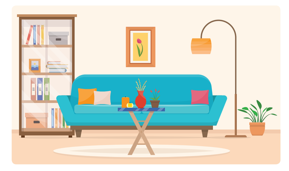
EXERCISE 1: Complete the sentences with 'near, between, on, in, behind, in front of, next to and under'.