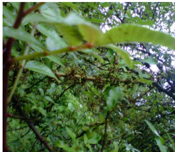
Figure 2. Andaliman at the age 4 years