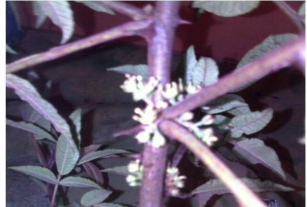
Figure 4. Andaliman Flower