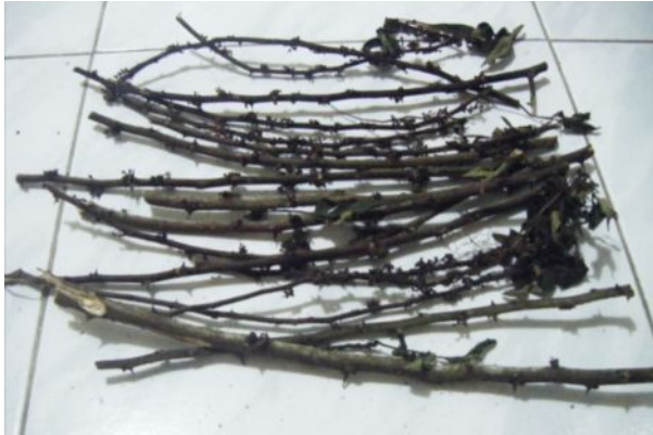
Figure 3. Andaliman Branches