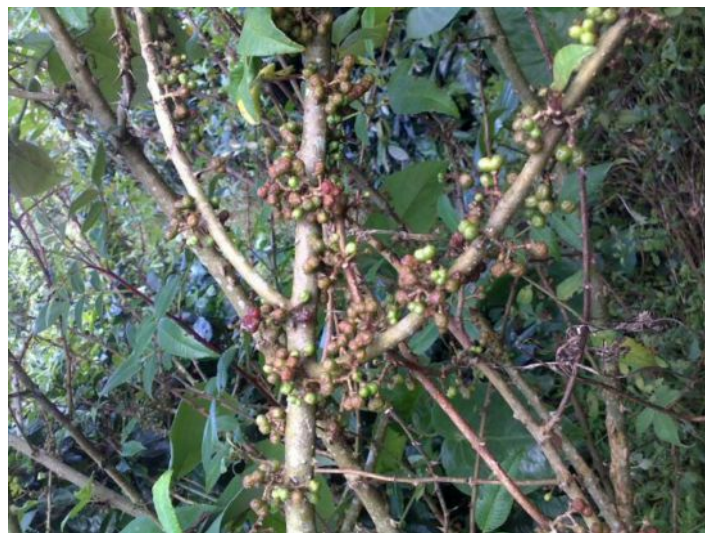
Figure 8. Andaliman Plant Ready to Harvest