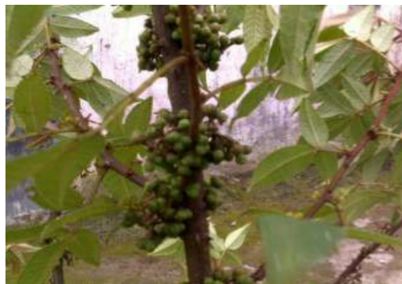
Figure 5. Andaliman Fruits

Zanthoxylum acanthopodium DC is known in Indonesia as andaliman. This plant has the native name in the region of North Sumatera which is intir-intir, and foreign names which are Sichuan pepper or Indonesian lemon pepper 3 . In Japan there are spices sansho ( Zanthoxylum piperitum DC) that have similar shape and fruit aromas with andaliman fruits. Moreover, in some countries, there are spices known as Z. simulans , and Z. bungeanum Maxim that have scents and volatile compounds which are also similar to andaliman 4 .