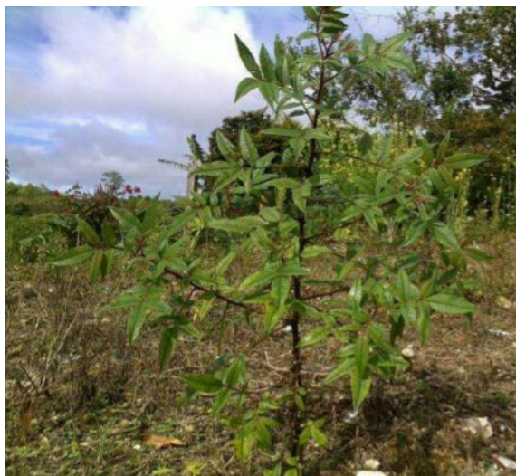
Figure 1. Andaliman at the age 2 years

As a spice, andaliman fruits have preservative power that makes Batak's cuisines last longer. This property was thought to be related to the presence of antimicrobial and antioxidant compounds. The antioxidant activity in food can be used to protect the fats / oils against oxidative damage. Andaliman fruits also contains vitamin C and E, which are useful to stimulate body endurance.