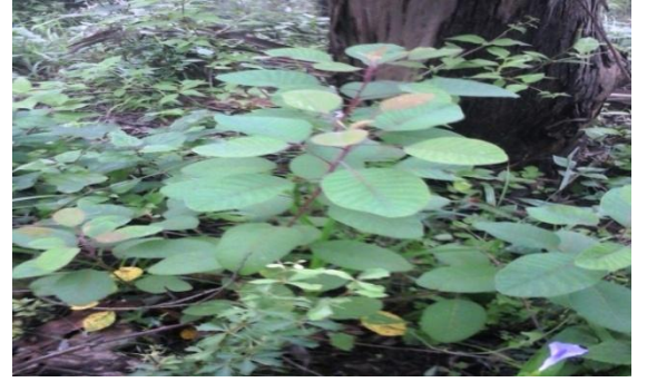
Figure 1 Rhus parviflora Roxb. plant

Rhus parviflora Roxb. belongs to the family Rosaceae and commonly known as Tungla or Tintideek , abundant as gregarious shrub or small trees, to 4m high; bark grey, smooth; on open, exposed, slopes of sub montane zones, ascending to 1800m, and found in W. Himalaya, C. India, Nepal and Sri Lanka<sup>6</sup>. In some tribal areas, infusions of leaves were given in cholera. Phytochemicals like gallic acid, some flavones viz., rutin, myricetin, quercetin, myricitrin, quercitrin, kampferol and some glycosides (isorhamnetin-3- \alpha -L-arabinoside) have been isolated from the plant<sup>7,8</sup>. In vitro anti-HIV activity and preliminary safety profile of the extracts prepared from the leaves of R. parviflora were also studied<sup>9</sup>. Plants are looked for their medicinal value since aeon, which they accumulate with their past experience with native flora<sup>11</sup>. And the present study is intended to study antimicrobial activity of the synthesized ZnO nanoparticles from aqueous leaves extract of this valuable medicinal plant shown in Figure 1.