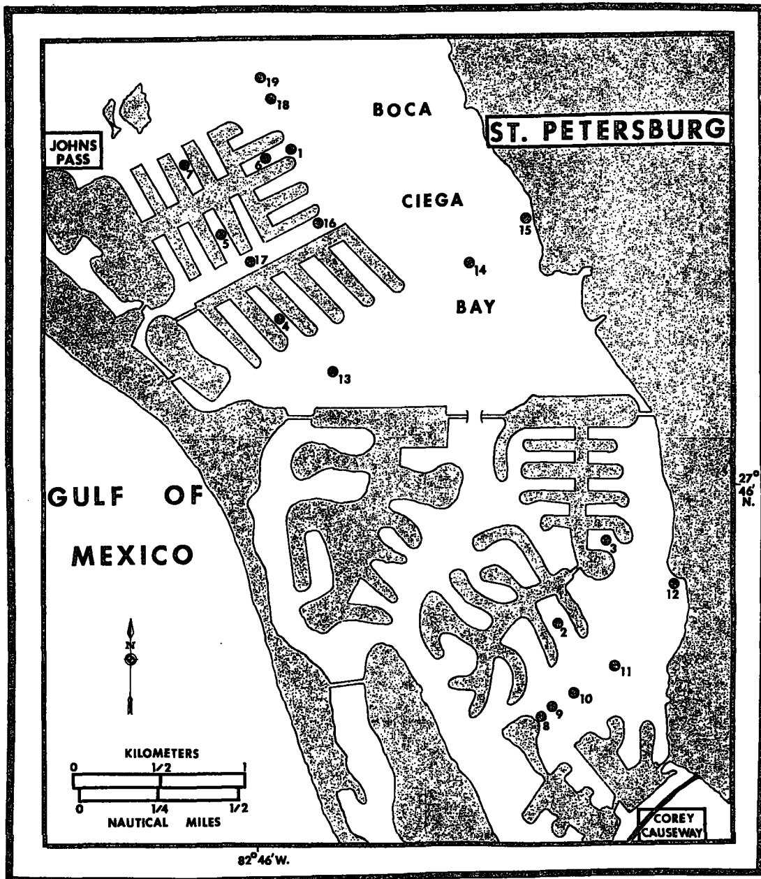
FIGURE 2.—Collecting stations 1 to 19, Boca Ciega Bay, Fla., between Johns Pass and Corey Causeway.

We washed samples for benthic organisms on a 24-mesh sieve which had an opening of 0.701 mm. and fixed the material retained by the sieve in a 10 percent sea-water Formalin 3 mixture. A protein stain (rose bengal) was added to facilitate the separation of small organisms from debris. Identified animals were preserved in 70 percent isopropanol.