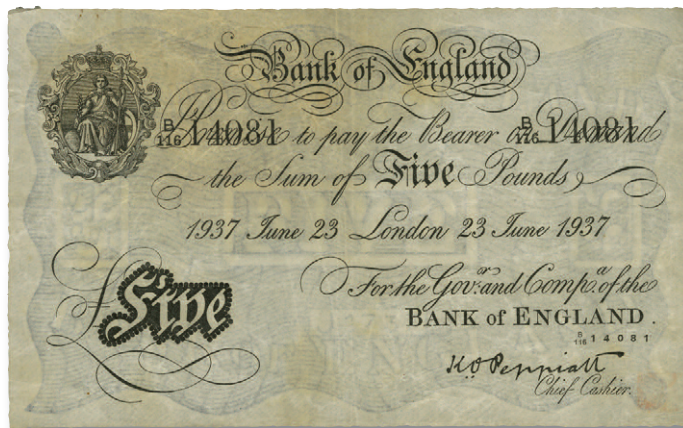
▲ This counterfeit £5 note was produced during World War II by the men of Operation Bernhard while they were confined at Sachsenhausen (below).