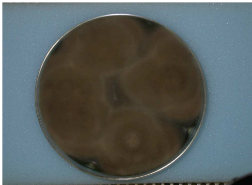
Figure 2. Colonies of P. chartarum on Sabouraud dextrose agar, after 10 days of incubation