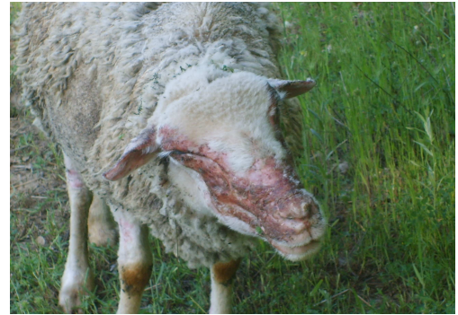
Figure 1. Sheep affected by Facial Eczema

Mycological analysis of the faeces allowed to notice fast-growing colonies (5cm in 8 days at 24°C), with cottony texture, color from white to gray-brown after sporulation (Figure 2). Microscopic examination of them showed the presence of septate hyphae, short conidiophores and single, multicellular, ovoid conidia (18-29x10-17µm), more or less intensely pigmented, with rough surface, usually restricted at the transverse septa (Figure 3). Moreover, after 5 days of moist chamber, similar conidiophores and conidia directly developed from grazed pasture samples (8-12% of colonization frequency).