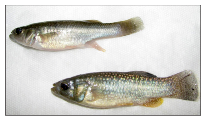
Figure 1. Adult female (above) and male (below) Gulf killifish, Fundulus grandis . Males are identified by their specked sides and white fin margins while females have an olive drab coloration.

Interest in killifish culture outside of previous pond production scenarios has sparked interest in recent research projects. This factsheet will describe non-pond based approaches for Gulf killifish culture. Since the initial research on pond culture of this species in the 1970's and 1980's, a number of advances in aquaculture technologies have allowed for new opportunities for culturing aquatic species. The application of phasebased systems that segregate reproduction and growth phases include outdoor tanks or indoor recirculation systems that provide improved environmental control, efficient methods for waste removal, and feeding. Additionally, there exists the potential for cross-over in these culture approaches for Gulf killifish to other related species such as the mummichog or Seminole killifish (F. seminolis).