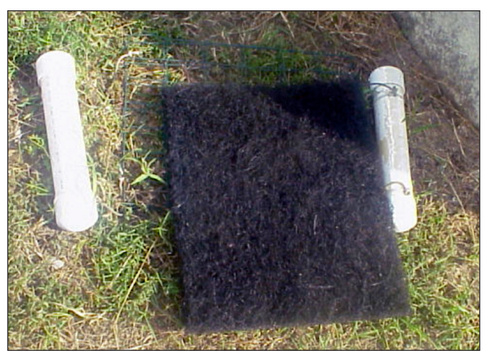
Figure 4. Spawntex<sup>®</sup> mat used for Gulf killifish, Fundulus grandis egg collection is suspended in tanks using capped PVC as floats.

There are a number of considerations for increasing egg production outside of sex ratios and stocking density in RAS and outdoor tanks. When using outdoor tanks the use of greenhouse shade cloth over approximately 80 percent of each tank has been demonstrated to increase the number of viable eggs collected during the summer months of egg production. Shade cloth can also be used in conjunction with netting to restrict access to the tanks by birds and other predators. Placement of spawning substrate in these tanks is similar to the placement of spawning mats in ponds. Mats cut to dimensions of 12 \times 18 inches (30 cm \times 45 cm) made of Spawntex<sup>®</sup> are