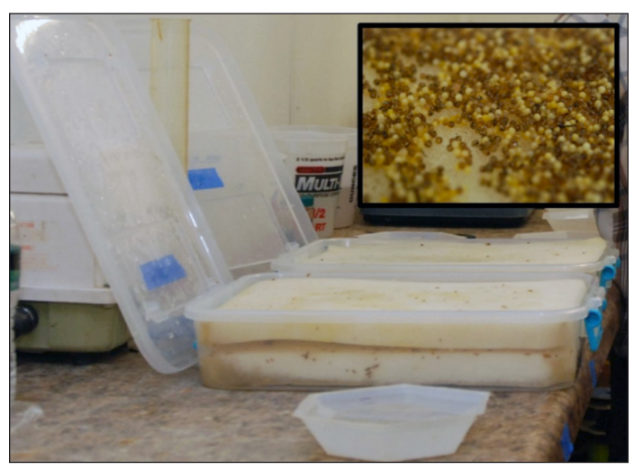
Figure 5. Storage totes containing wetted foam for air incubation of Gulf killifish, Fundulus grandis eggs (inset).

environment. These eggs then hatch when the tides return between 13 to 15 days later. Aquaculturists can take advantage of this unique adaptation within Fundulus spp. by incubating cohorts of collected eggs in a similar way. Batches of eggs can be placed on foam mats (expanded polystyrene or soft hobby foam) that have been previously soaked in 7 to 9 ppt salinity water. Foam of a similar size should be placed on top of a single layer of eggs to form a sandwich that can be placed within a container, e.g., small storage tote (Fig. 5). The salinity of the incubation water used to keep the foam wet (i.e. spray bottles) can be increased (up to 18 ppt) to reduce fungal/mold/bacterial formation on the eggs throughout incubation. Air incubation reduces the protracted hatch time observed in water incubation and reduces the likelihood of larger larvae consuming younger and smaller individuals.