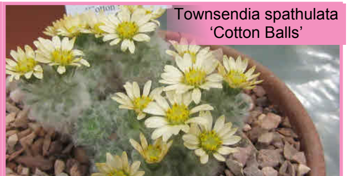
Townsendia spathulata 'Cotton Balls'