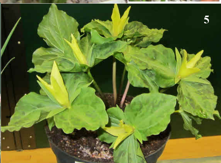
3. Pterostylis curta 4. Cymbidium goeringii 5. Trillium luteum 6. Fritillaria bucharica