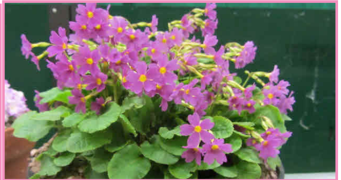
Primula fDavid Valentinefielator x juliae