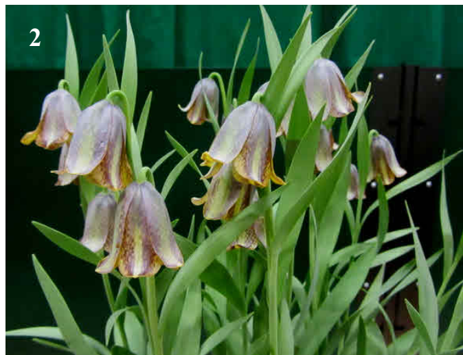
1 Fritillaria alfredae glaucoviridis & 2. Fritillaria crassifolia kurdica from Don Peace