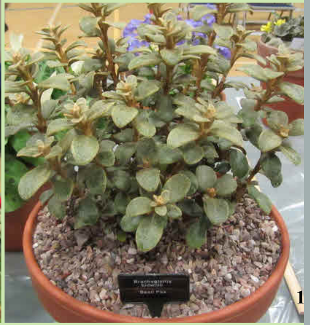
1. Brachyglottis bidwillii 'Basil Fox'