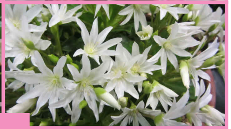
Colour forms of Lewisia tweedyi