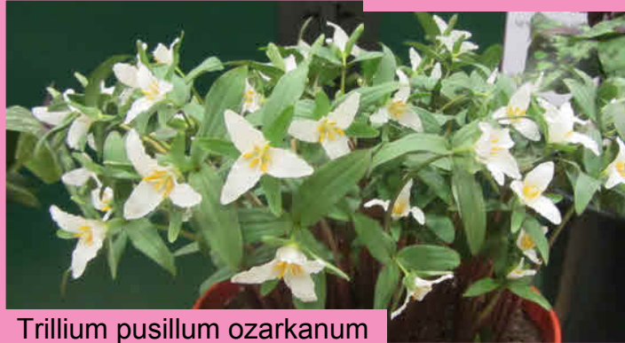
Trillium pusillum ozarkanum