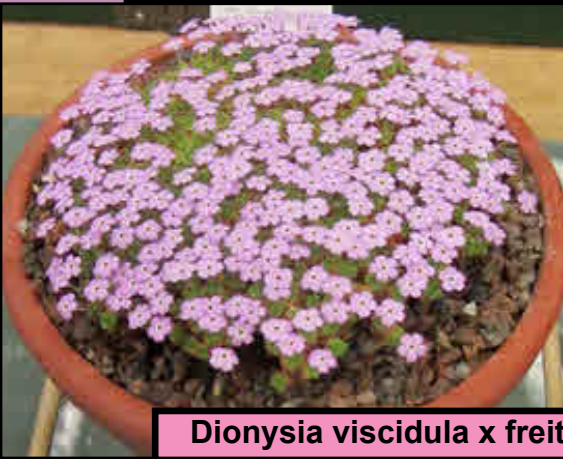
Dionysia viscidula x freitagii