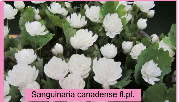
Sanguinaria canadense fl.pl.