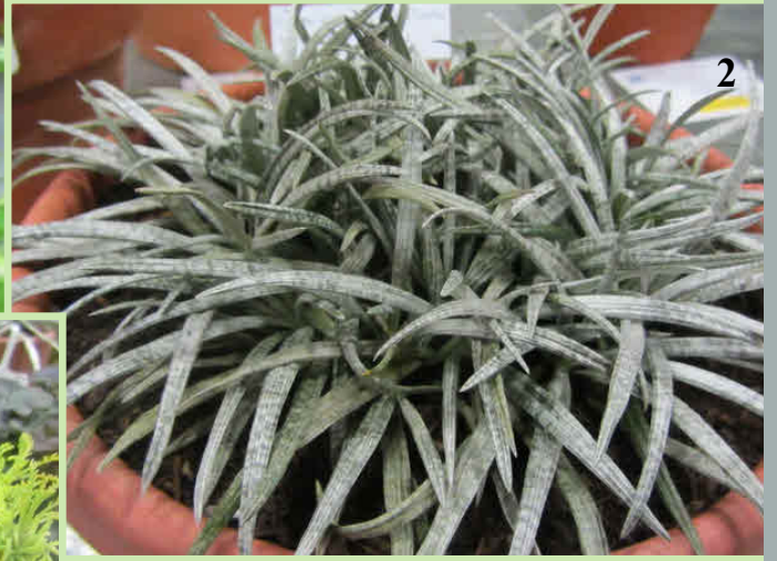
2. Senecio serpens