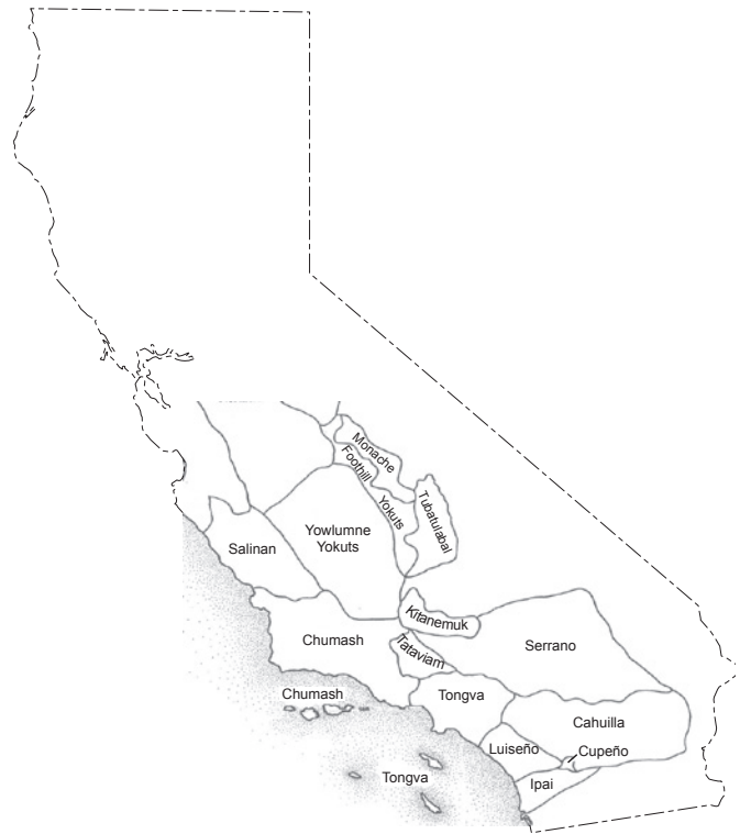
Figure 3-2 Approximate Locations of Tribal Lands. (source: HAN 1981)

The Chumash Indians originally occupied the northern portion of the California bight and northward considerably beyond this prominent geographical feature. The California bight includes coastal southern California, the Channel Islands, and parts of the Pacific Ocean. The greatest concentration of Chumash ranged from western Los Angeles County to the southern half of San Luis Obispo County, and inland to southwestern Kern County (HIS 2007). As is the case with many if not most Native Americans, much of the recorded information about their culture comes from archaeological investigations, the records of early European explorers, and ethnographic data.