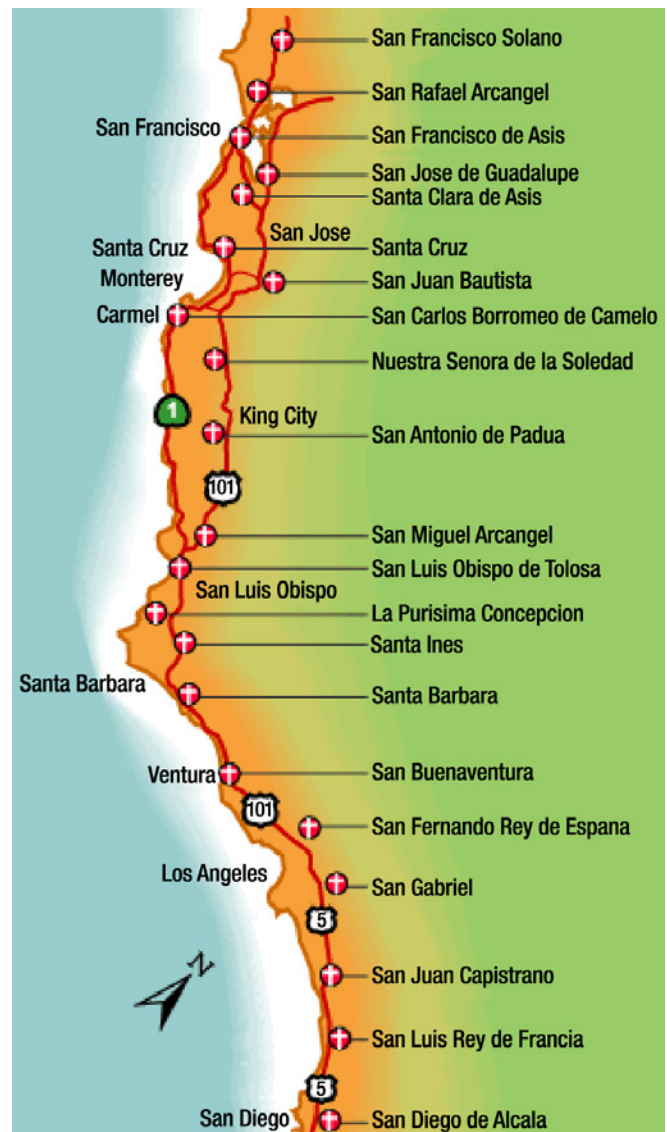
Figure 3-3. Spanish Missions of California.

The Mexican-American War, spanning from 1846 to 1848 ended with California becoming a U.S. Territory. California was admitted to the Union as the thirty-first state in 1850.