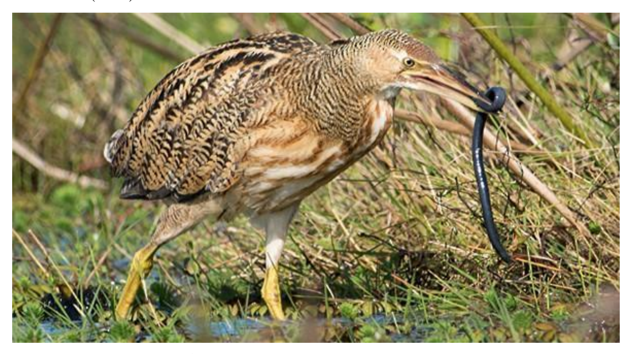
Fig. 1. Pinnated bittern, Botaurus pinnatus .

Order: Pelecanifermes Class: Aves (Birds)