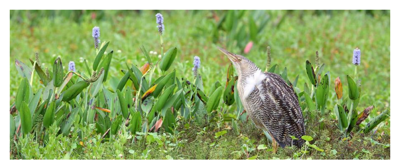
Fig. 5. Pinnated bittern in a crouched position.