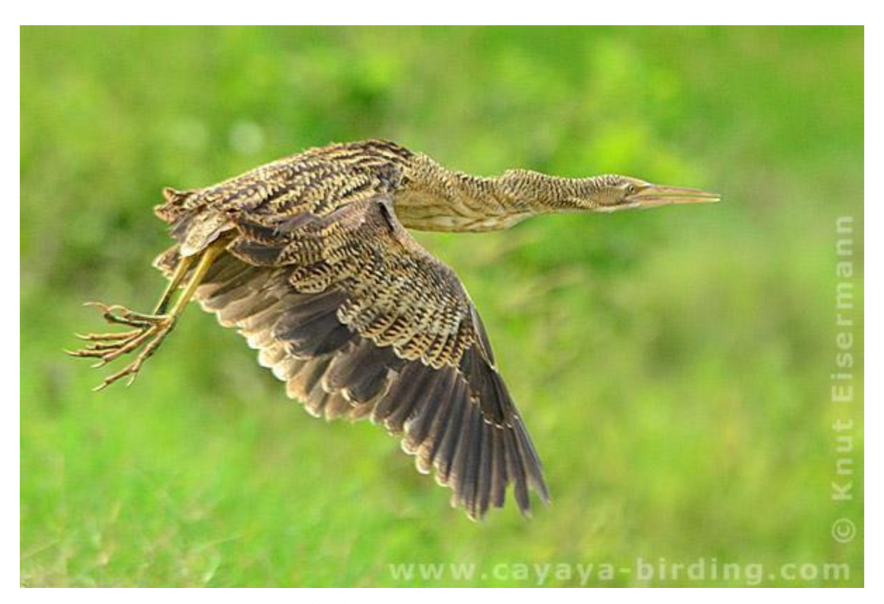
Fig. 4. Pinnated bittern in flight.

\underline{https://www.cayaya\text{-}birding.com/birdphotos/herons.htm}