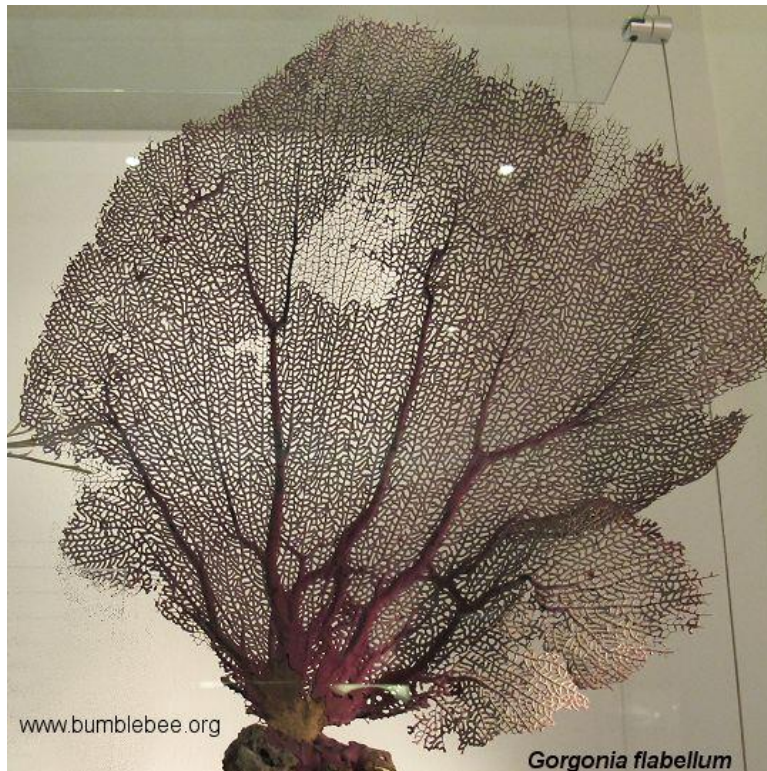
Fig. 3. A dry Gorgonia flabellum , removed from its environment.

[ http://www.aquamaps.org/receive.php?type_of_map=regular , downloaded 14 March 2016]