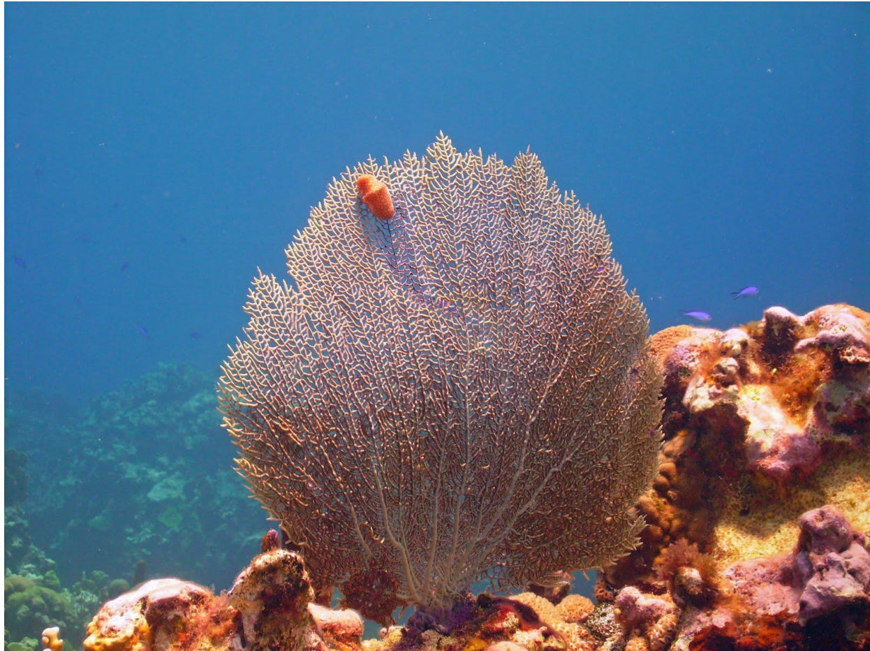
Fig. 1. Venus sea fan, Gorgonia flabellum .

Phylum: Cnidaria (Corals, Sea Anemones and Jellyfish)