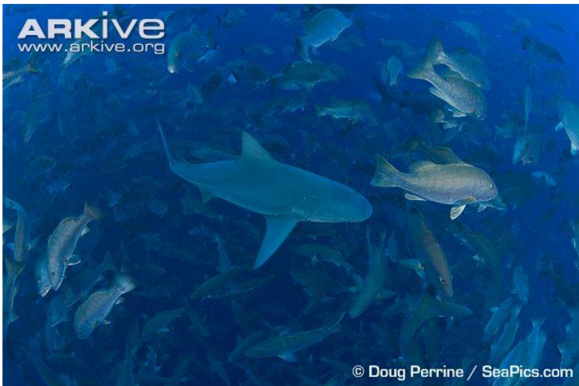
Fig. 3. Mutton snapper spawning aggregation (with shark preparing for a meal).

[ https://www.flmnh.ufl.edu/fish/discover/species-profiles/lutjanus-analis , downloaded 27 October 2016]