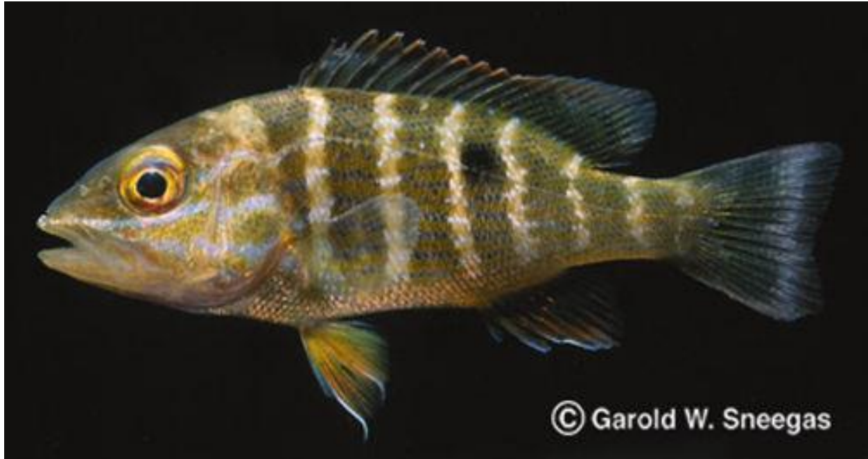
Fig. 4. Juvenile Lutjanus analis .

[ http://www.coralreeffish.com/lutjanidae.html , downloaded 27 October 2016]