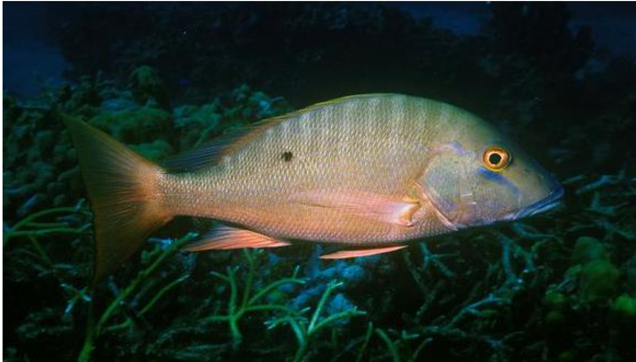
Fig. 1. Mutton snapper, Lutjanus analis .

[ http://www.arkive.org/mutton-snapper/lutjanus-analis/image-G65499.html , downloaded 27 October 2016]