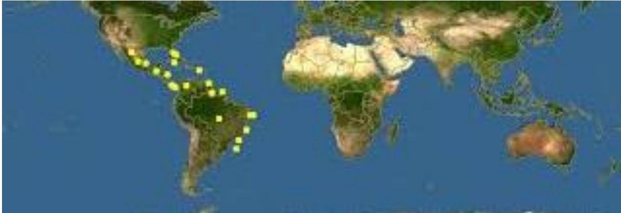
Fig. 2. Fat snook geographic distribution.

[ http://www.discoverlife.org/mp/20m?kind=Centropomus+parallelus , downloaded 27 September 2016]