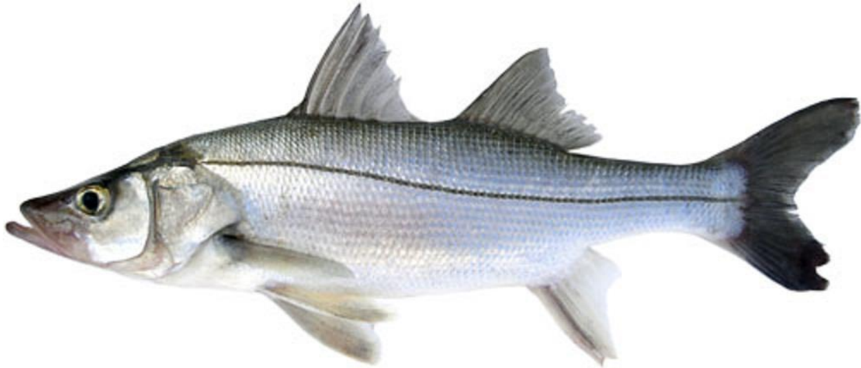
Fig. 1. Fat snook, Centropomus parallelus .

[ http://peixesdesportivosdomundo.blogspot.com/2012/03/o-camurim-obeso-centropomus-parallelus.html , downloaded 27 September 2016]