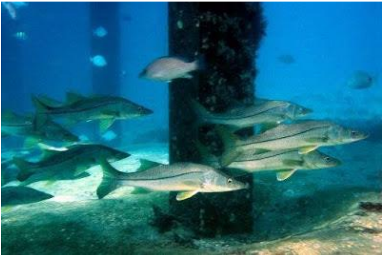
Fig. 3. Fat snook travelling in a school.

[ http://www.discoverlife.org/mp/20m?kind=Centropomus+parallelus , downloaded 27 September 2016]