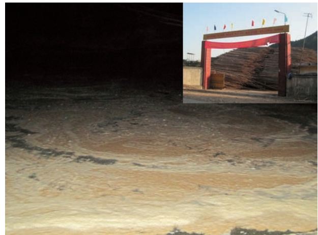
Fig. 3. Waste water releasing directly to the Ba Che River at station 2 (see Fig. 1) from Ba Che Paper Factory (smaller picture). at 9 pm, 19 February 2011.

Forest coverage is still high in the present area, but a greater area is covered by artificial forest as in other