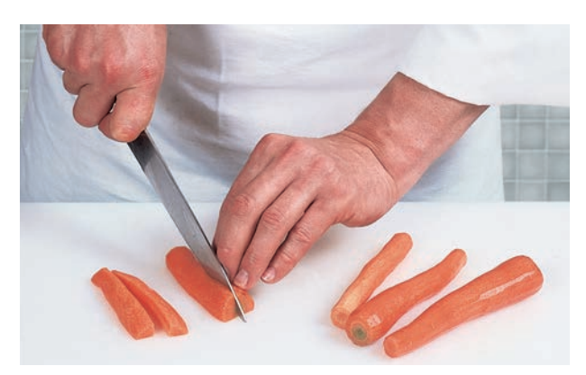
Depending upon the diameter of the carrot, cut these pieces lengthways again into two, three or four pieces as required.