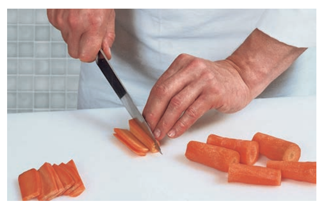
Slice the pieces into uniform sections of approximately 4 mm in thickness. Alternatively, use a mandolin.