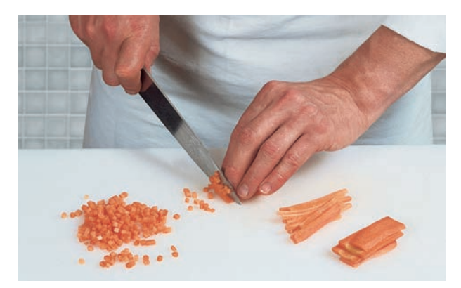
Carefully cut the vegetable into uniform cubes of 2 mm.

The different stages in the Macedoine cut are identical to those of the Brunoise cut. Only the dimensions are different.