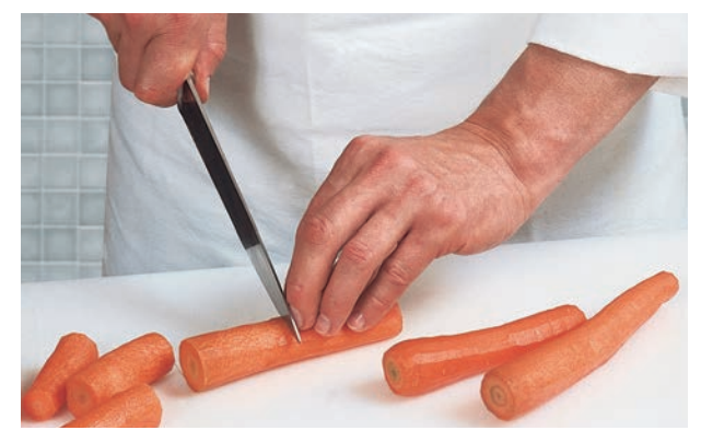
Cut the carrot in half lengthways.

(roughly chopped for chunky soups, Matignons, aromatic garnish for fish fumet)