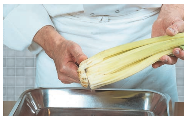
Cut off the base of the celery to separate the stalks from one another.