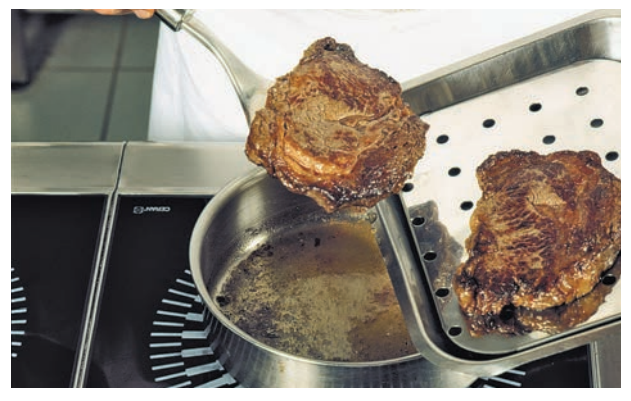
Transfer the pieces of meat onto a perforated tray or onto an overturned plate. Keep the meat warm while the sauce is being made.

Cook to the desired level of doneness (very rare, bloody, medium rare, well done)