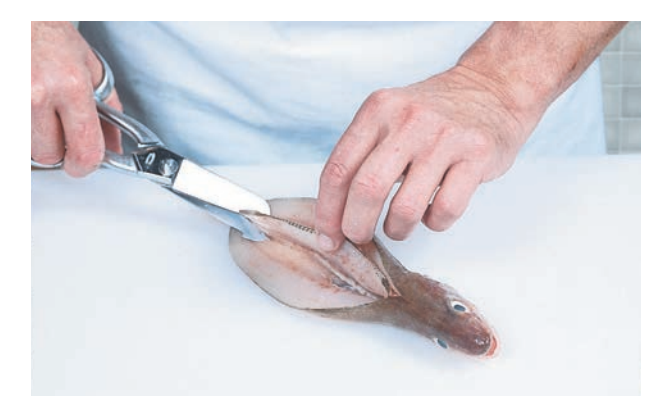
Cut the backbone near the head and the tail using a pair of sharp scissors.

Carefully remove the second fillet, without detaching the head, stopping at the same level as f or the first fillet (about 1 cm from the tail).