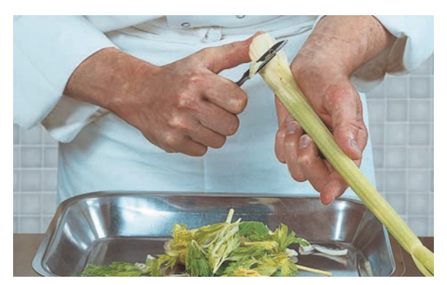
If necessary, peel the base of the stalk with a paring knife to ensure that all fibres are completely removed.

Remove any green leaves from the stalks. They can be set aside to make bouquet garnis.