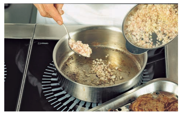
Remove some of the fat from the pan.