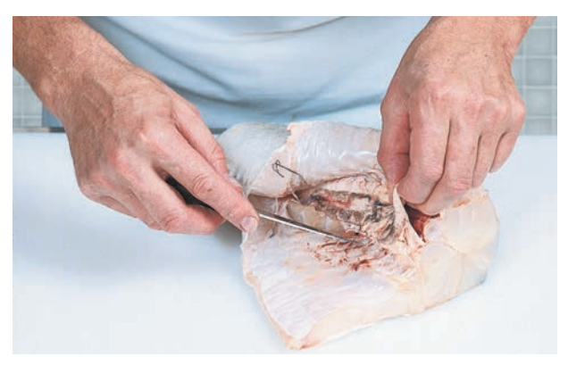
Lift and remove the swim bladder with a paring knife. Scrape away any blood clots.

Remove the peritoneum (blackish membrane). Remove it by hand or by drying it with paper towel (when the fish is very fresh, the peritoneum firmly attaches to the flesh).