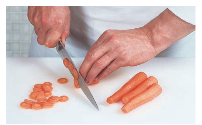
Choose straight carrots. Then slice them perpendicularly with a fish filleting knife or a paring knife.

(for glazed carrots, creamed carrots, aromatic garnishes)