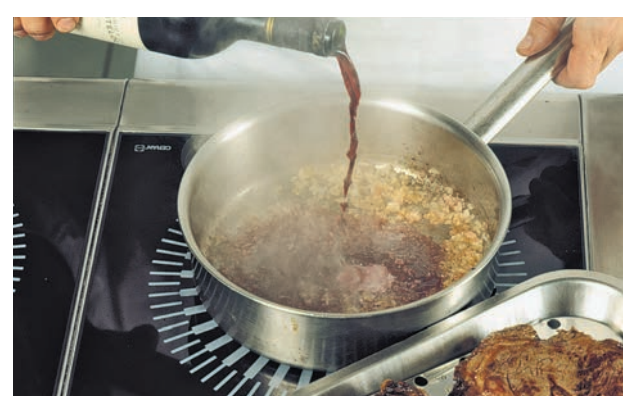
Deglaze with white or red wine of your choice. Reduce the wine by two thirds to reduce the risk of acidity.