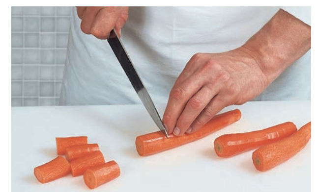
Cut the carrots into uniform pieces.