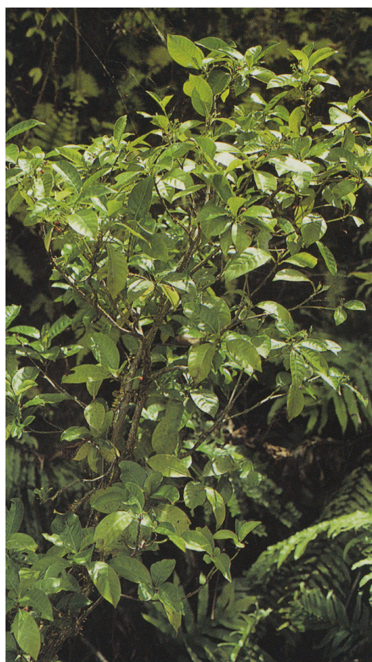
Psychotria hombroniana var. malaspinae