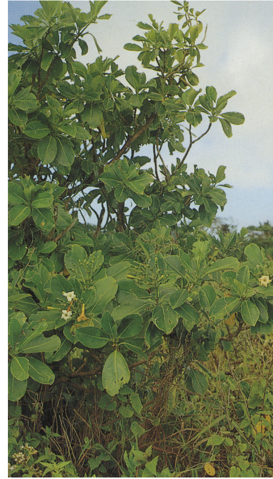
Fagraea berteriana var. ladronica