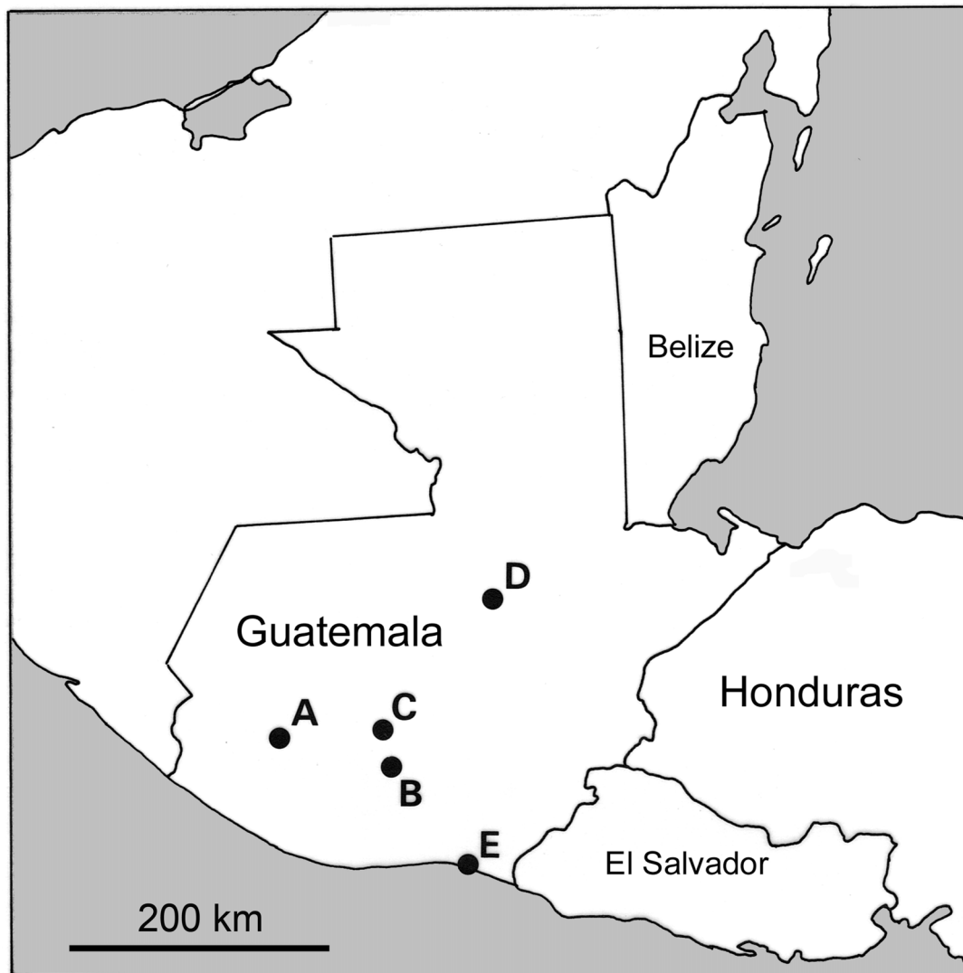
FIGURE 1. Indication of the main collecting sites. A. Area of Quezaltenango. B. Guatemala city. C. Mixco Viejo. D. Area of Coban. E. Monterrico (mentioned in brackets after the country under specimens examined).

The specimens are kept in the herbarium of the collector (van den Boom), unless otherwise indicated. The holotype collections are deposited in the herbarium of the University of Graz, Austria (GZU).