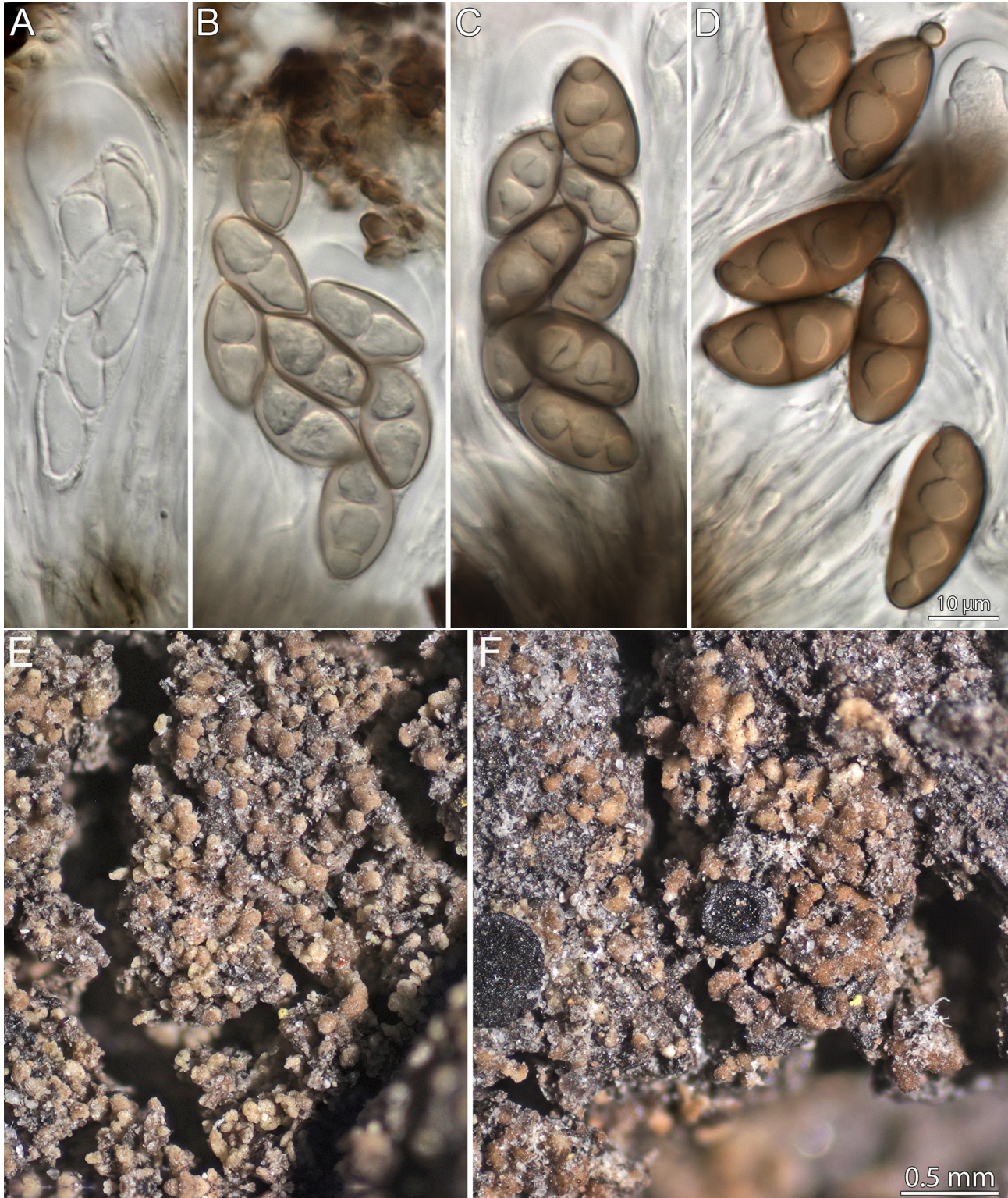
FIGURE 4. Sculptolumina conradiae , holotype. A. Immature ascospores with a single lumen. B. Young 1–2-septate ascospores. C–D. Mature 3-septate ascospores with four \pm rounded lumina (similar to the Conradia -type) and walls not ornamented. D–E. Habit.

Presently, the genus Sculptolumina includes only two taxa, the type species, S. japonica and S. serotina . They differ from S. conradiae in both their chemistry and ascospores. S. japonica contains anthraquinones and has Mischoblastia -type ascospores whereas S. serotina contains the lobaric acid chemosyndrome and has ascospores similar to those of S. conradiae but 1-septate, with only two rounded lumina ( \pm Pachysporaria -type) instead of 3-septate, with four rounded lumina. Both grow on bark, lignum or decaying plants, mainly in subtropical to tropical regions and are also present in Guatemala.