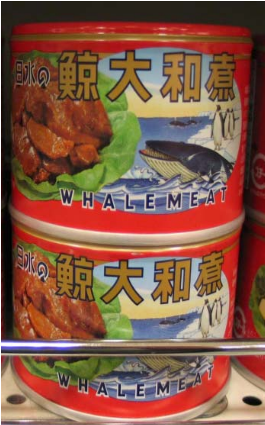
Above: Nissui brand canned whale meat on sale at a supermarket in Japan.

Since 1987, Nissui and its partners through Kyodo Senpaku have killed nearly 7,000 Antarctic minke whales in the Southern Ocean Sanctuary. 4