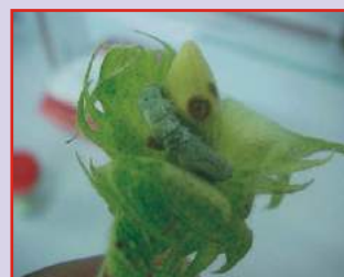
N. rileyi fungus infected larva

Scientific name: Nomuraea rileyi Host insect (s): Semi looper & American bollworm Nature of association: Pathogenic to larvae