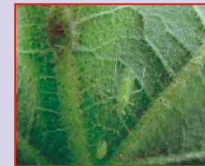
Adult of Zanchius sp.

Common name : Mirid bug Scientific name : Zanchius sp. Family : Miridae Order : Hemiptera Host insect (s) : Whiteflies Nature of association : Nymphs and adults are predatory