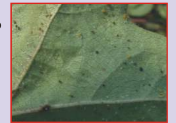
Mummified aphids parasitised by Aphelinus

Common name : Aphid parasitic wasp Scientific name : Aphelinus sp. Family : Aphelinidae Order : Hymenoptera Host insect (s) : Aphids Nature of association : Nymphal and adult parasitoid