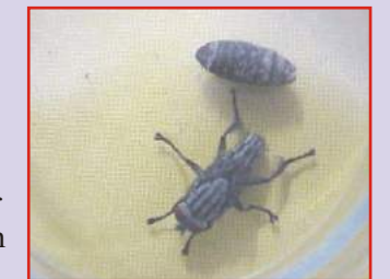
Tachinid-Pupa & adult

Common name : Tachinids Scientific name : Palloxista laxa Curran Family : Tachinidae Order : Diptera Host insect (s) : Semi looper & American bollworm Nature of association : Larval parasitoid