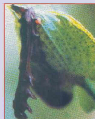
NPV infected larva

Scientific name: Nuclear polyhedrosis virus Host insect (s): American bollworm Nature of association: Pathogenic to larvae