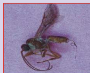
Adult of Bracon

Common name: Bracon parasitoid Scientific name: Bracon greeni Ashm. Family: Braconidae Order: Hymenoptera Host insect (s): Pink bollworm Nature of association: Larval parasitoid