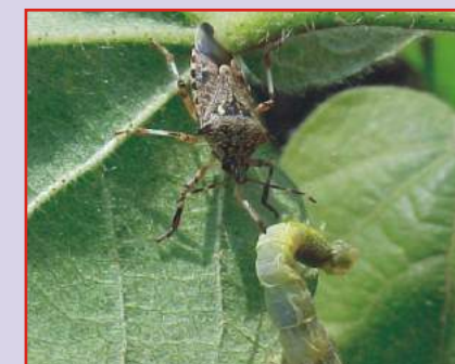
Pentatomid bug feeding on looper

Common name : Pentatomid bug Scientific name : Eocanthocona furcellata (Wolff) Family : Pentatomidae Order : Hemiptera Host insect (s) : Larvae of bollworms and semi-looper Nature of association : Nymphs and adults are predatory