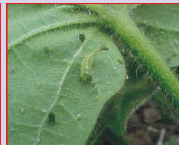
Syrphid maggot feeding on aphids