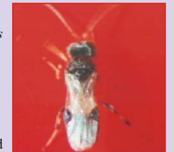
Adult of M. versatilis

Common name : Braconid parasitoid Scientific name : Microchelonus versatilis Family : Braconidae Order : Hymenoptera Host insect (s) : American bollworm Nature of association : Egg- larval parasitoid