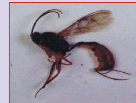
Adult of E. argenteopilosus