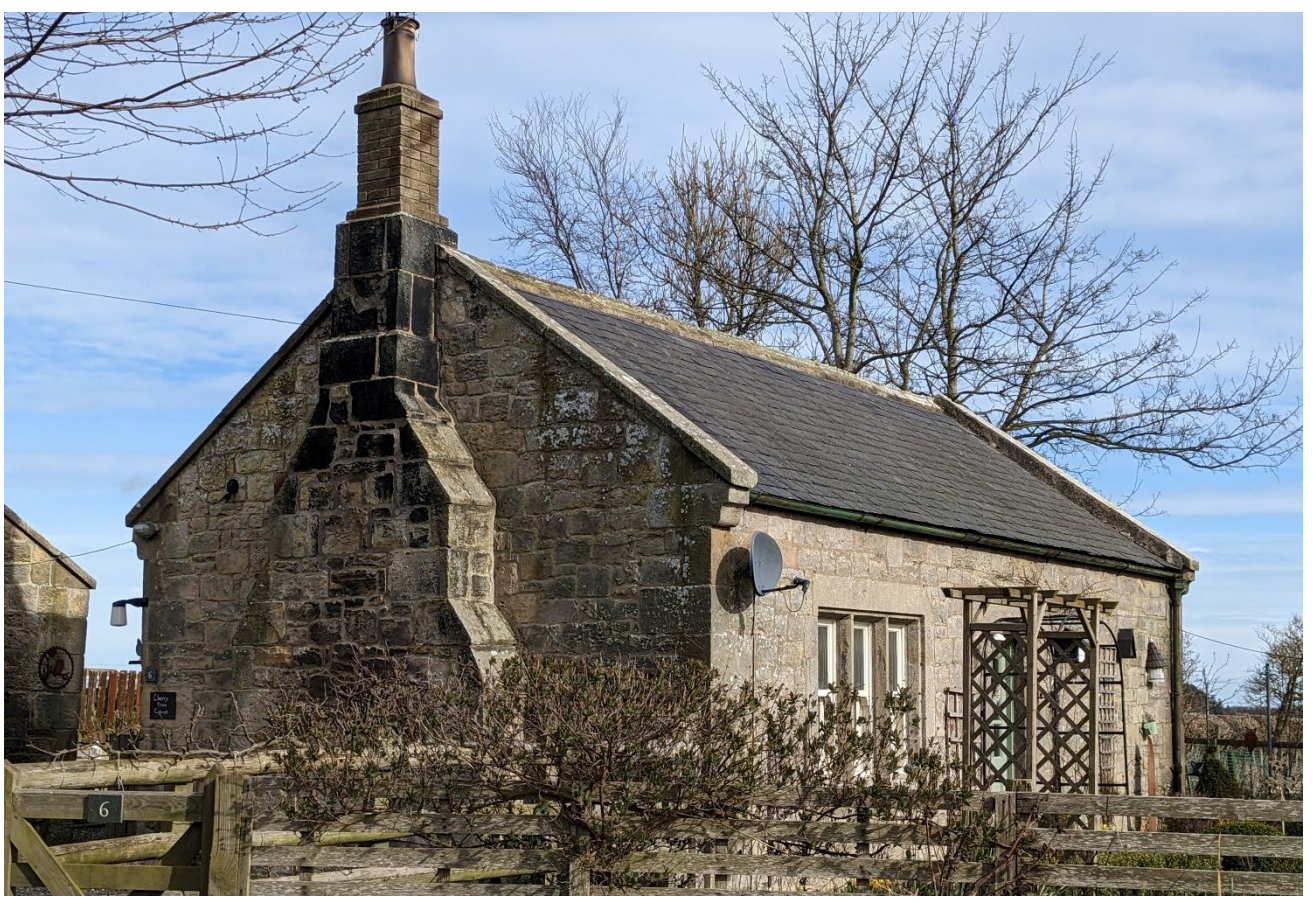
Typical building styles in South Charlton