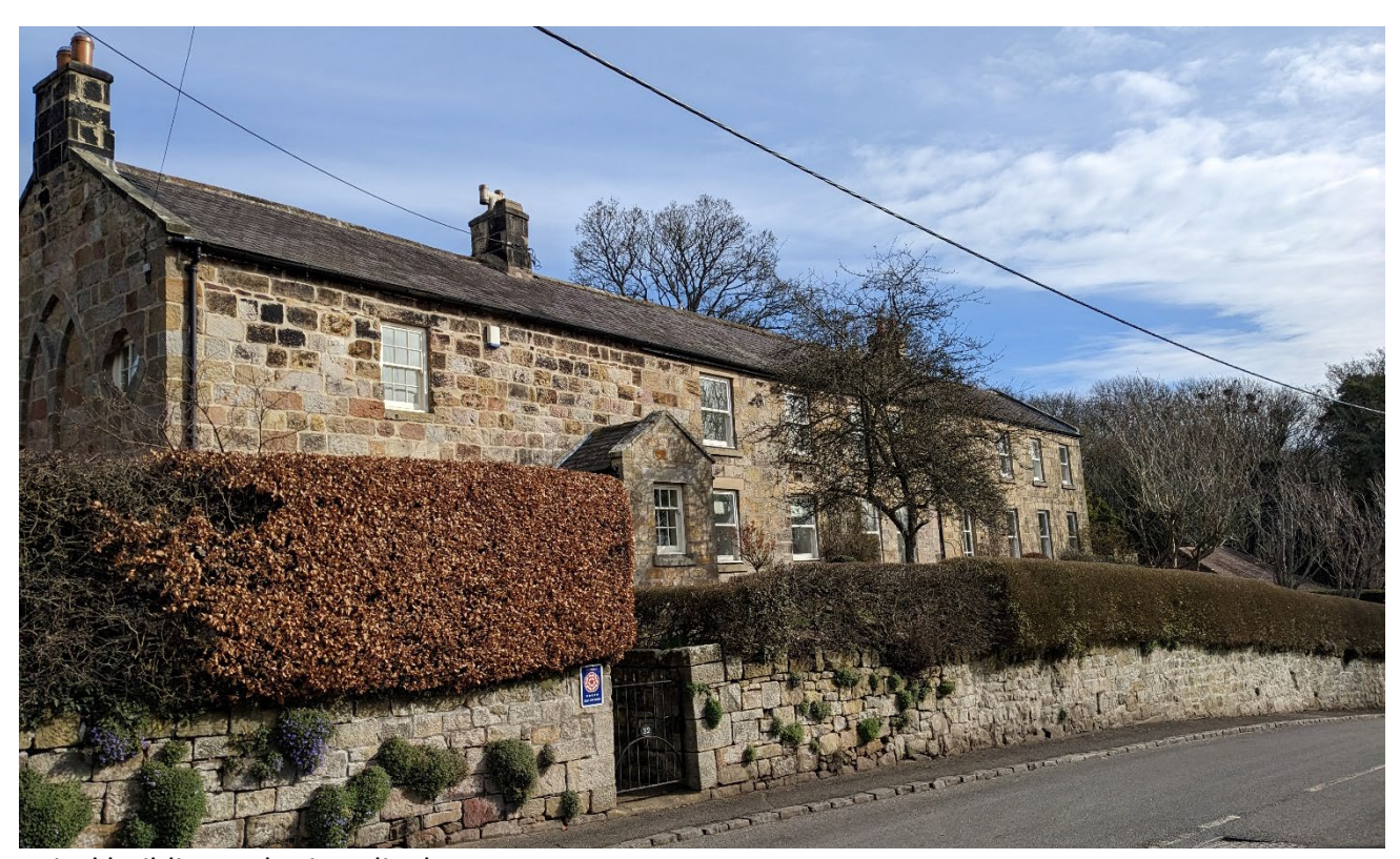
Typical building styles in Eglingham

7.7 The Parish's two principal settlements are Eglingham and South Charlton. There are also a number of smaller settlements in the neighbourhood area, including North Charlton, East and West Ditchburn and Harehope, as well as individual farms and their associated buildings.