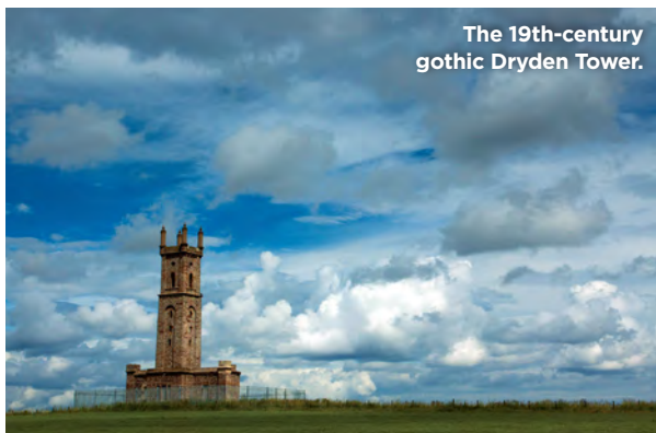
The 19th-century gothic Dryden Tower.

▶ Distance: 4½ miles/7.25km ▶ Time: 2 hours ▶ Grade: Moderate