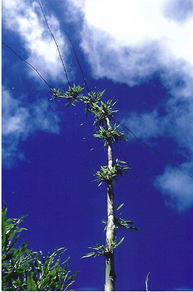
Figure 47 Cathariostachys madagascariensis can sag more than shown.