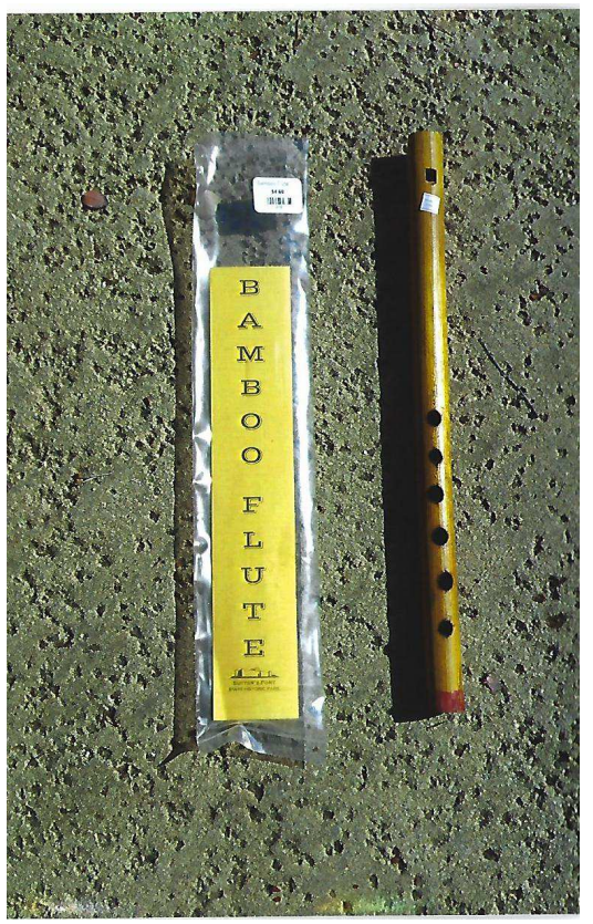
Figure 1 Bamboo Flute purchased at Sutter's Fort, Sacramento, Calif. Feb. 2020

If it's been a year since you last renewed or joined please renew today. It's easy! Just go to the socalabs.org website and click on "Join Us!". From there click "Join Me Up!". Fill out requested information and review and donate!