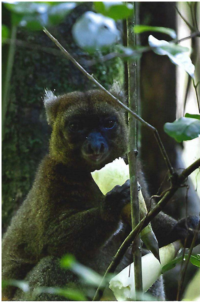
Figure 46 Greater Bamboo Lemur.