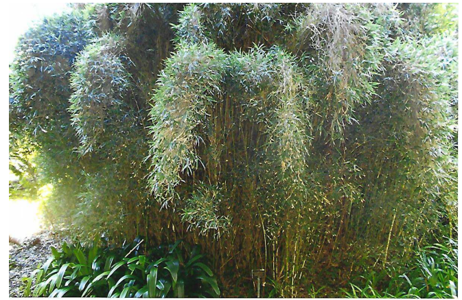
Figure 34 Thamnocalamus tessellatus