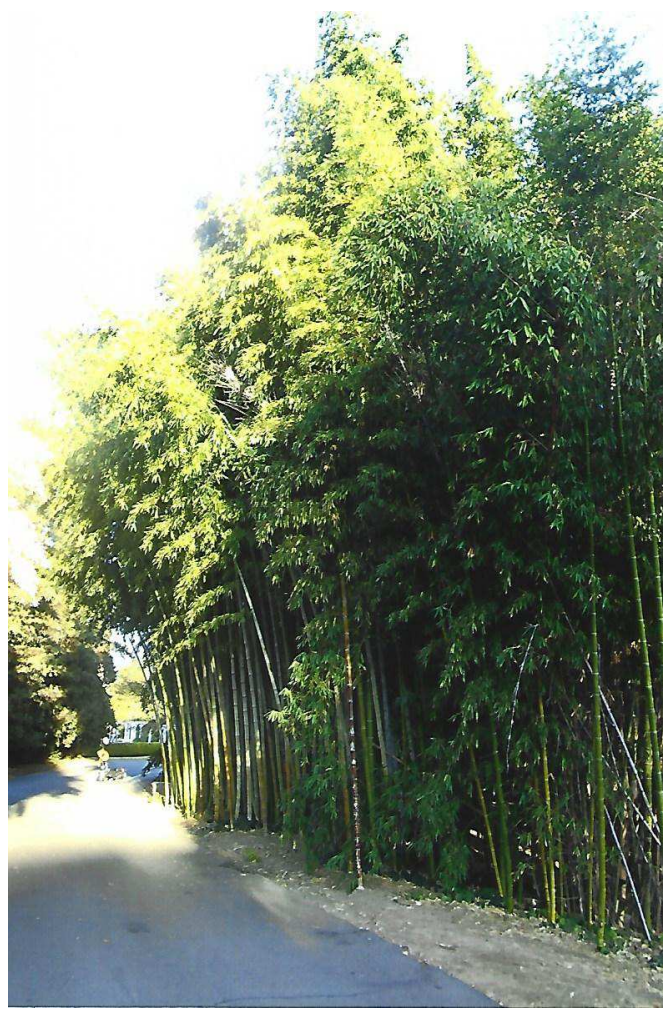
Figure 24 Phyllostachys vivax