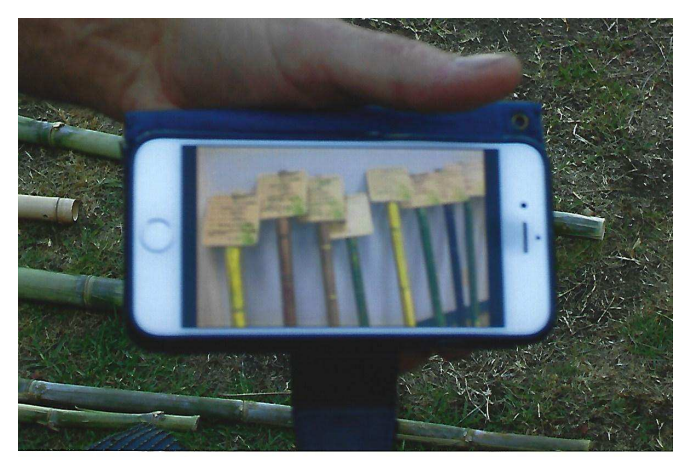
Figure 17 Phone screen showing bamboo signs