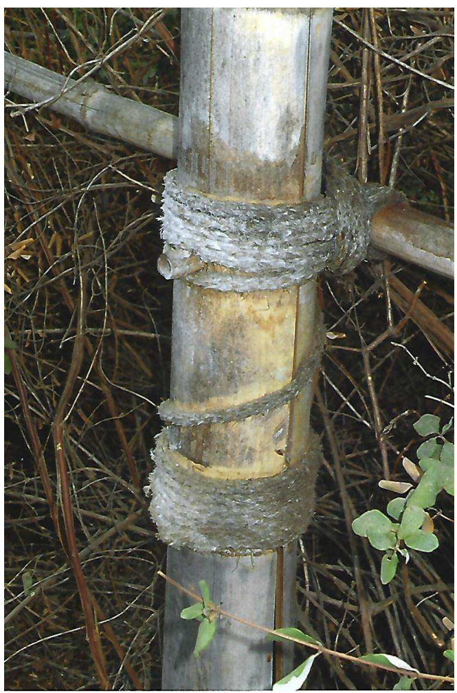
Figure 26 Lashing detail