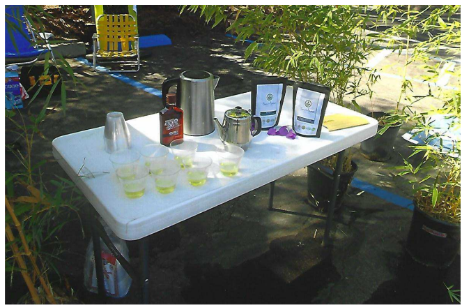
Figure 31 Bamboo tea anyone?