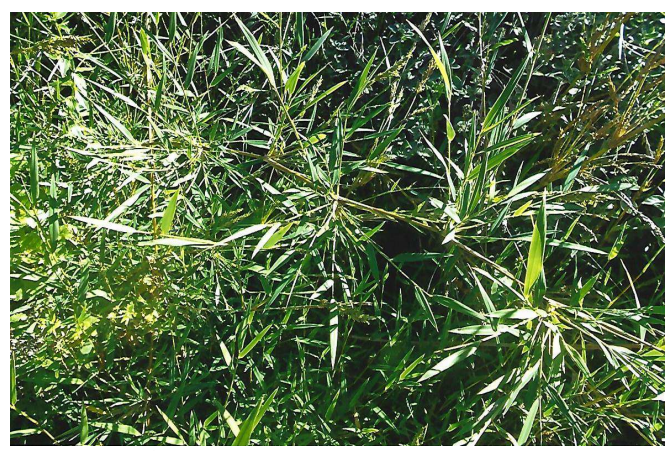
Figure 36 Chusquea gigantea