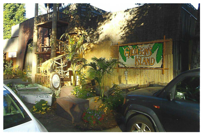
Figure 39 Mock-up of 1960s TV show Gilligan's Island