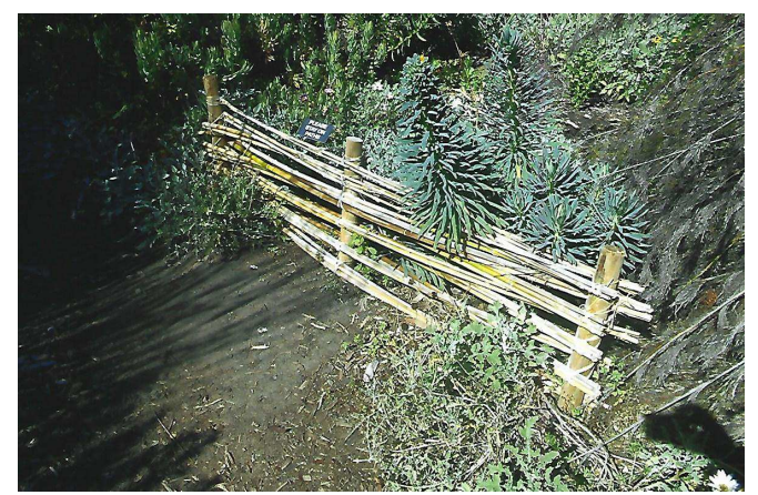
Figure 37 Bamboo barrier fence