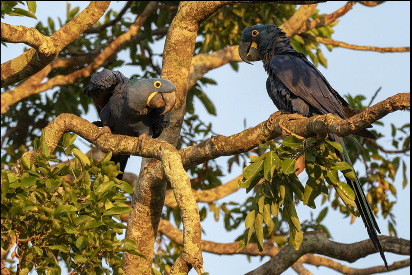
Back on land, within the grounds of our hotel we managed great views of these sought-after species: Hyacinth Macaw (above) and the hulking Southern Screamer (below).