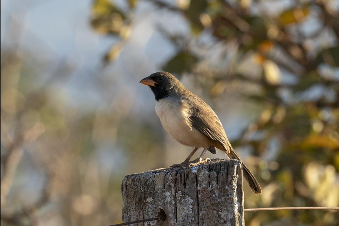
Black-throated Saltator in the Cerrado (above) and Flavescent Warbler in a nearby gallery forest