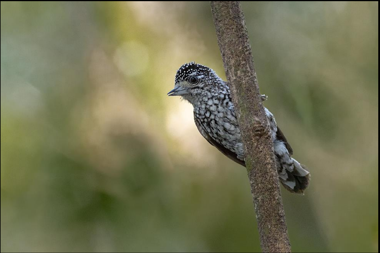
Among many other birds we found in this walk were this White-wedged Piculet (above) and Buff-breasted Wren (below)