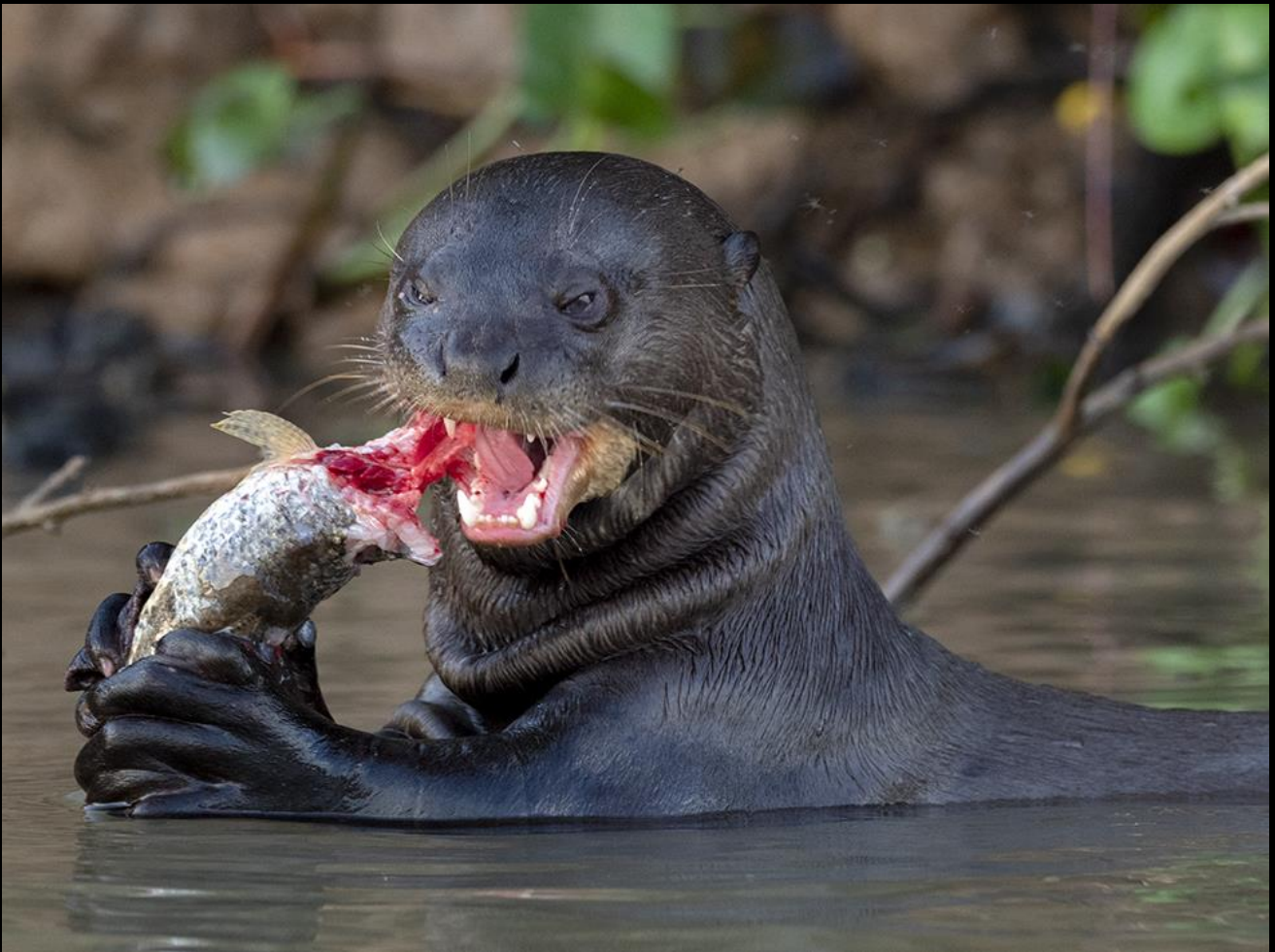
The river also holds healthy populations of Giant Otters (above) that feed on the huge amount of large fish, shared with tons of fishermen (tourists and local) and plenty of waterbirds like this young Rufescent Tiger-Heron (below).