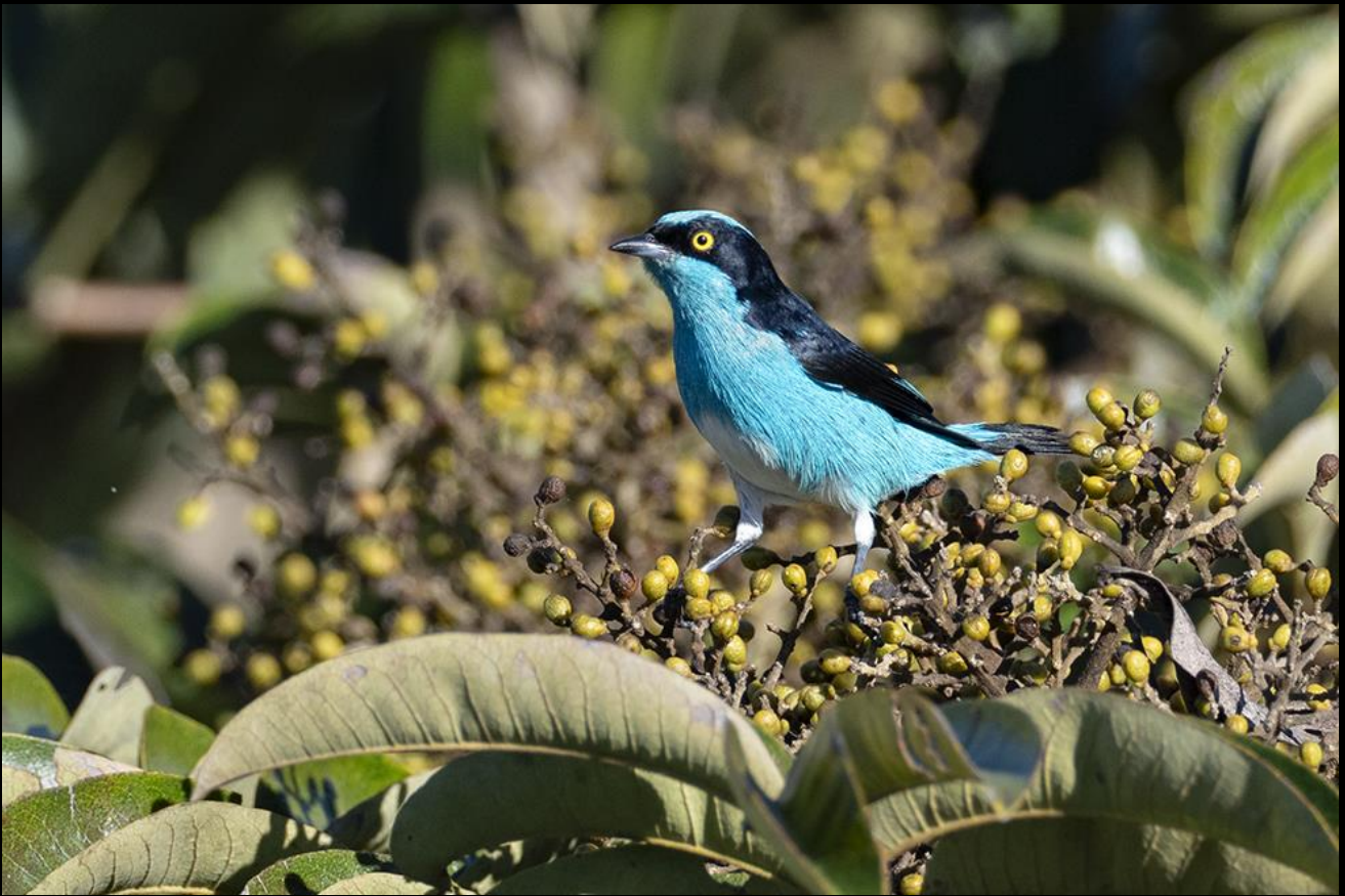
From the canopy tower we found tons of tanagers like this Black-faced Dacnis (above) and Turquoise Tanager (below)