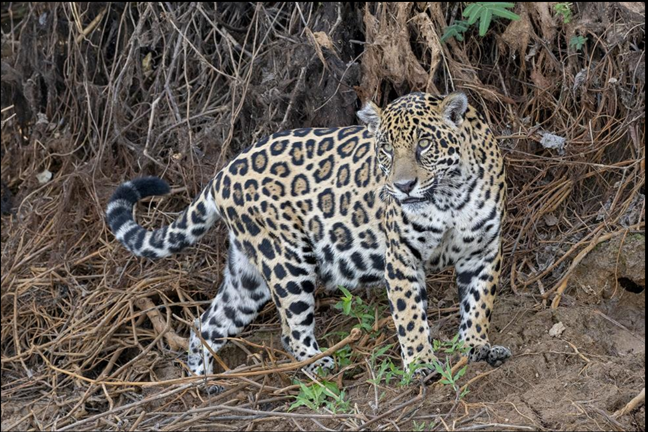
That afternoon we found our first Jaguars (a total of 6 we saw on the tour). These photos are of the very first one .