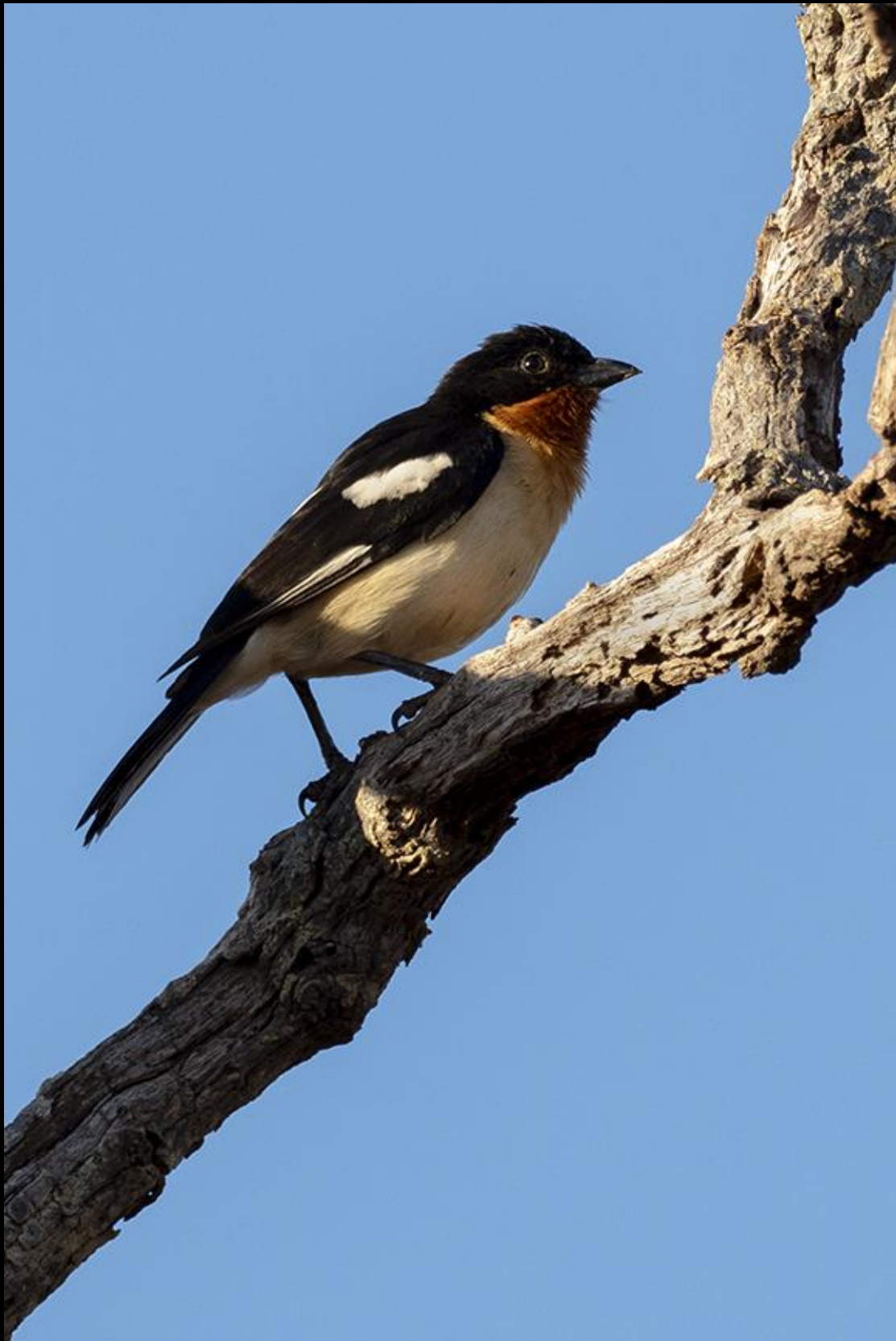
One of the Cerrado specialties is this White-rumped Tanager