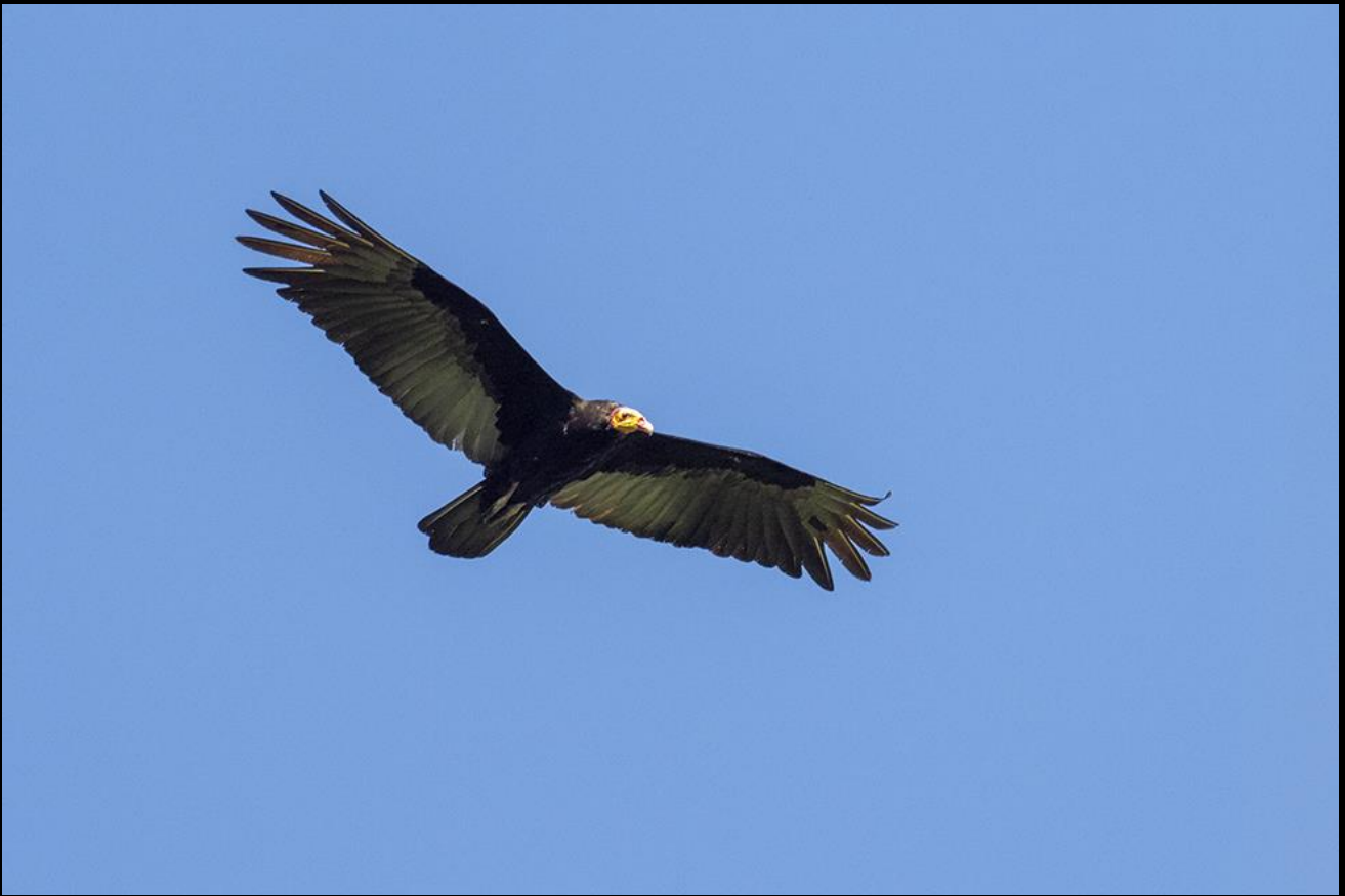
Also flying close to eye-level we got Greater Yellow-headed Vulture (above) and Blue-and-yellow Macaws (below)