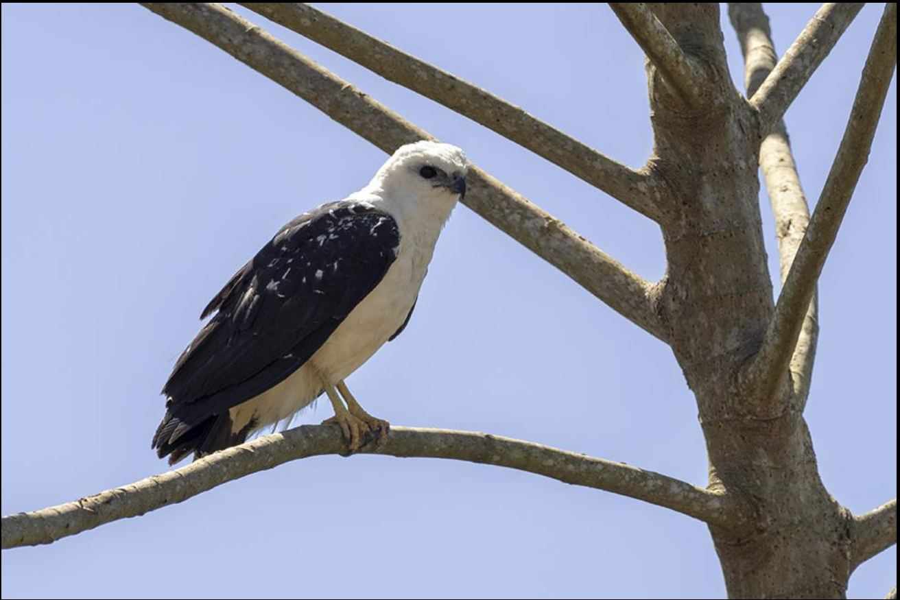
The beautiful White Hawk (above) was seen on the day we departed from Cristalino towards the Pantanal. That day we also found a pair of Black Hawk-Eagles, a lonely Gray-lined Hawk and a few Roadside Hawks for a very “raptory” day. Below is the modest Blackish Nightjar that is sometimes found on the roofs of the staff cabins.