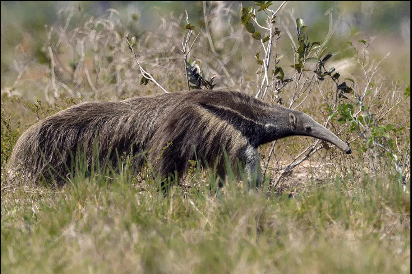
On the very first day of birding the Pantanal we found two of the most wanted creatures of the area, the weird-looking Giant Anteater (above) and the also quite unique Red-legged Seriema (below)