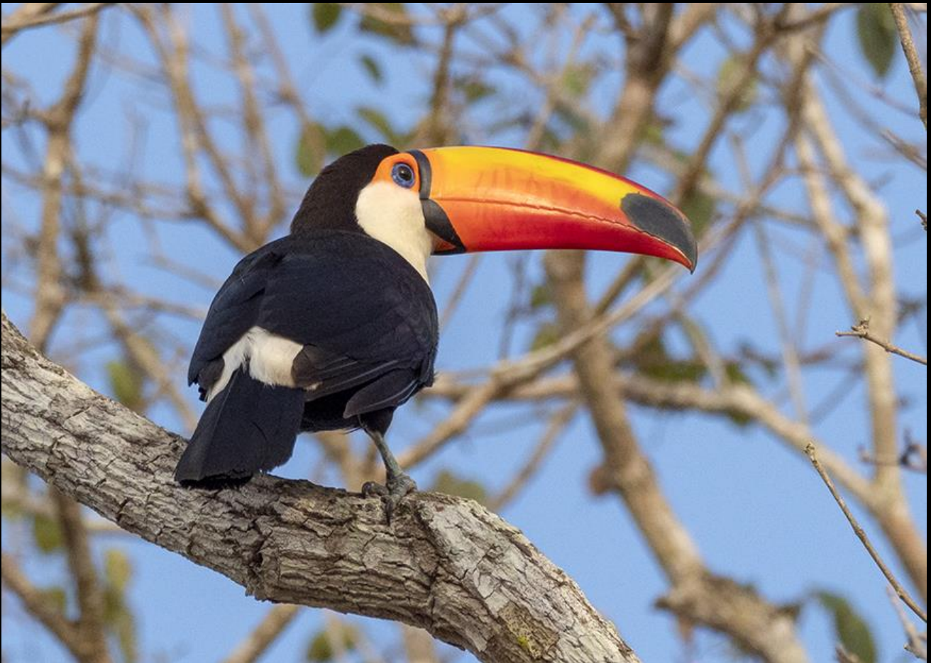
On the last morning of the trip Toco Toucans (above) finally decided to pose for photos; and on the way back to the city of Cuiaba we picked up birds like Subtropical Doradito plus we managed nice photos of Rusty-backed Antwren.