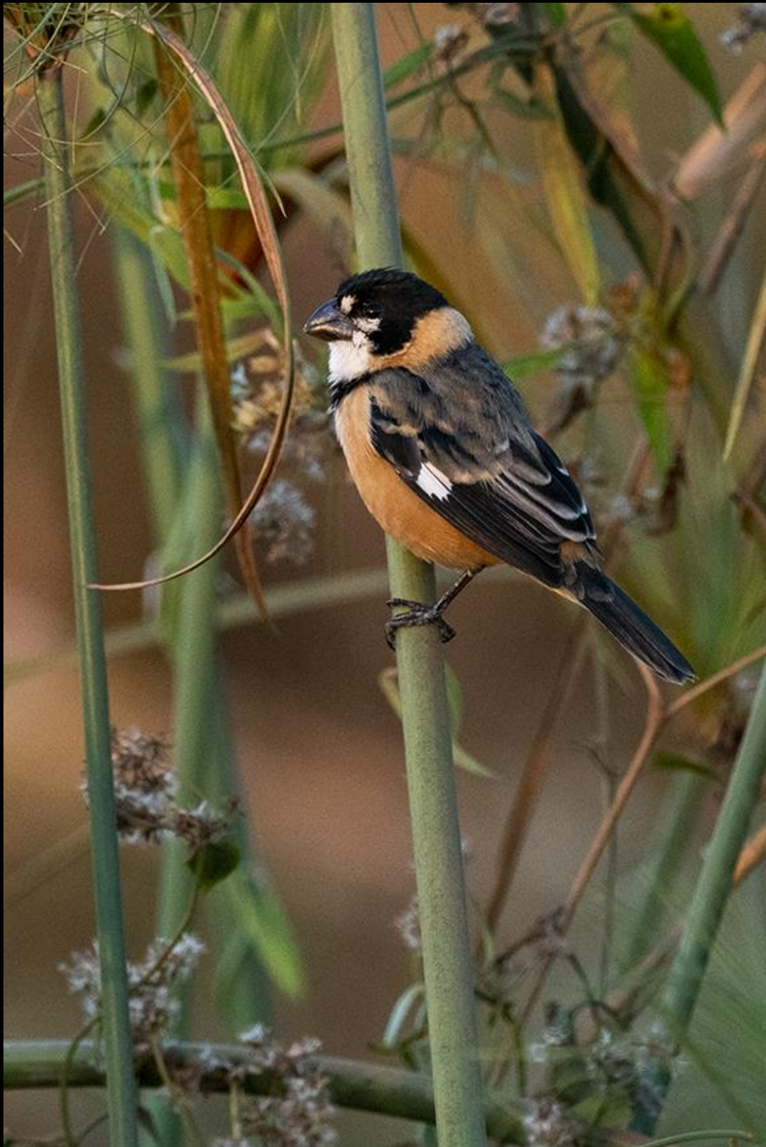
Not only big birds are attractive in the Pantanal, small passerines like this Rusty-collared Seedeater were also eye candy during our birding days. This was photographed close to dusk from the Transpantaneira highway.