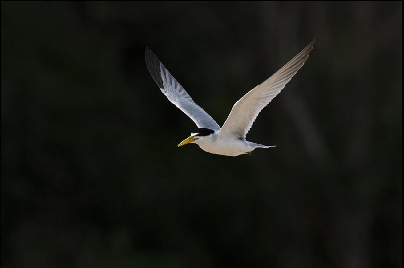
Finally we made it to the Cuiaba River in the afternoon of day 13. The sandy beaches held populations of Large-billed and Yellow-billed Terns (above) plus Black Skimmers (below), Pied Lapwings and Collared Plovers.