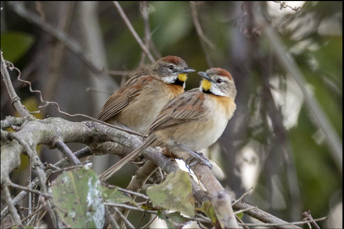
We found a few new birds for the trip during our boat rides. In this case they were passerines in the form of Chotoy Spinetails (above) and White-browed Meadowlarks (below).