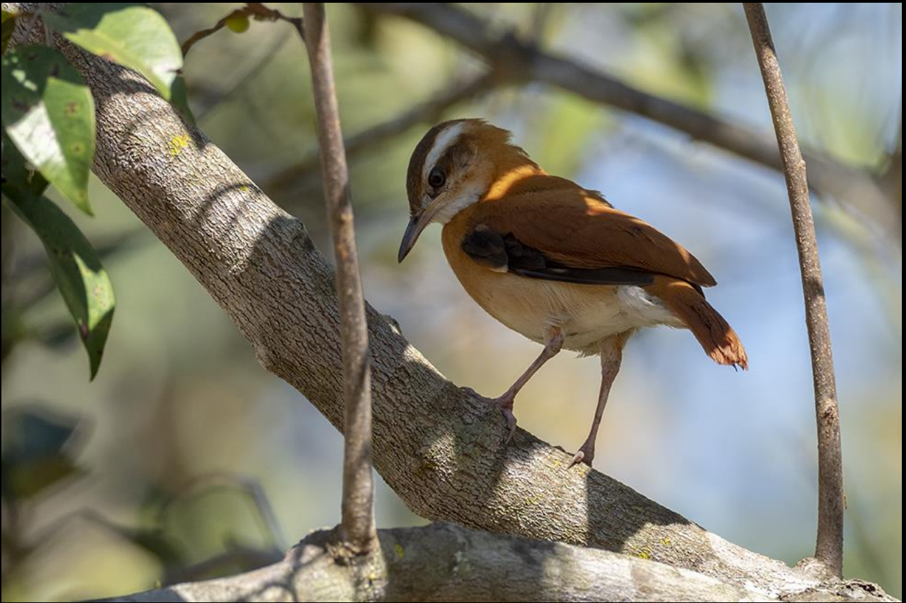
The gallery forests near the rivers are home to Pale-legged Horneros (above) and Band-tailed Antbirds (below)