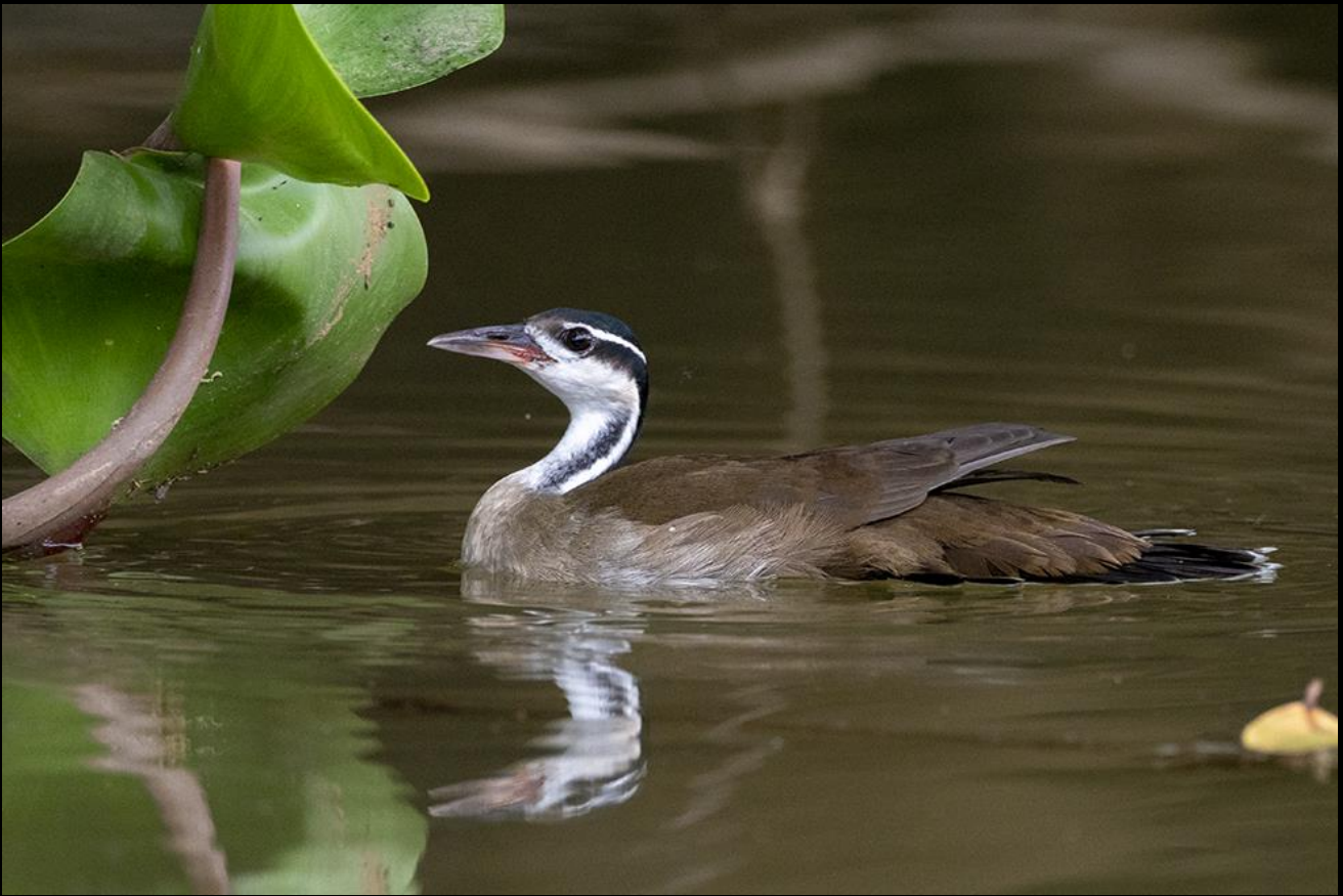
White searching for Jaguar we found this very cooperative Sungrebe (above) which was always on the shady side of the river. On the other hand, this young Boat-billed Heron alerted us of the presence of a Jaguar when it flew nervously to a higher more exposed perch than its usual hidden roost.