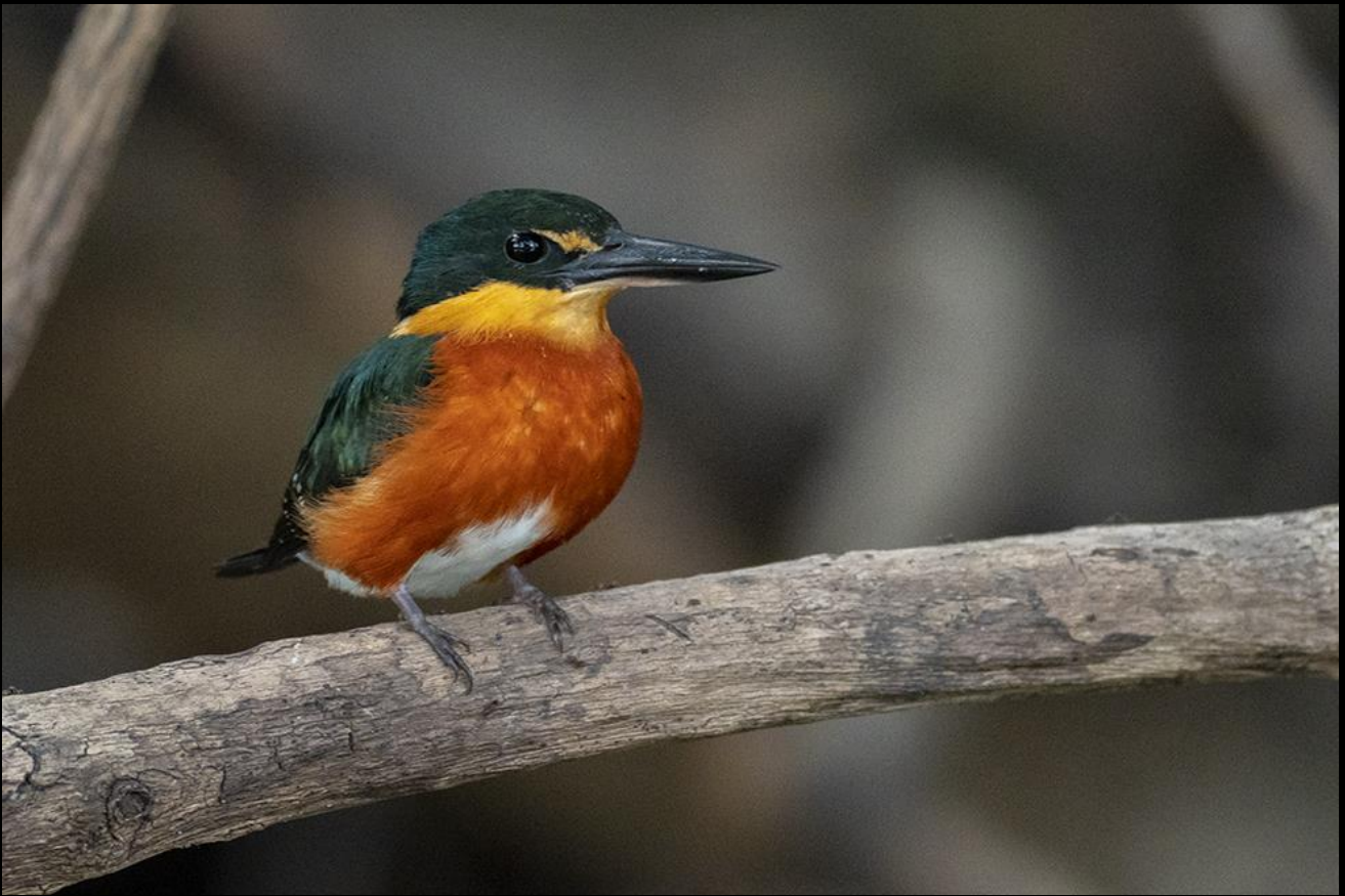
From the same Hotel Pantanal Mato Grosso we took two boat rides that gave us great photography opportunities. On the menu were superb birds like this American Pygmy-Kingfisher (above) and the always charismatic Black-capped Donacobius which loves the floating vegetation along the river. That day we saw all 5 kingfisher species too