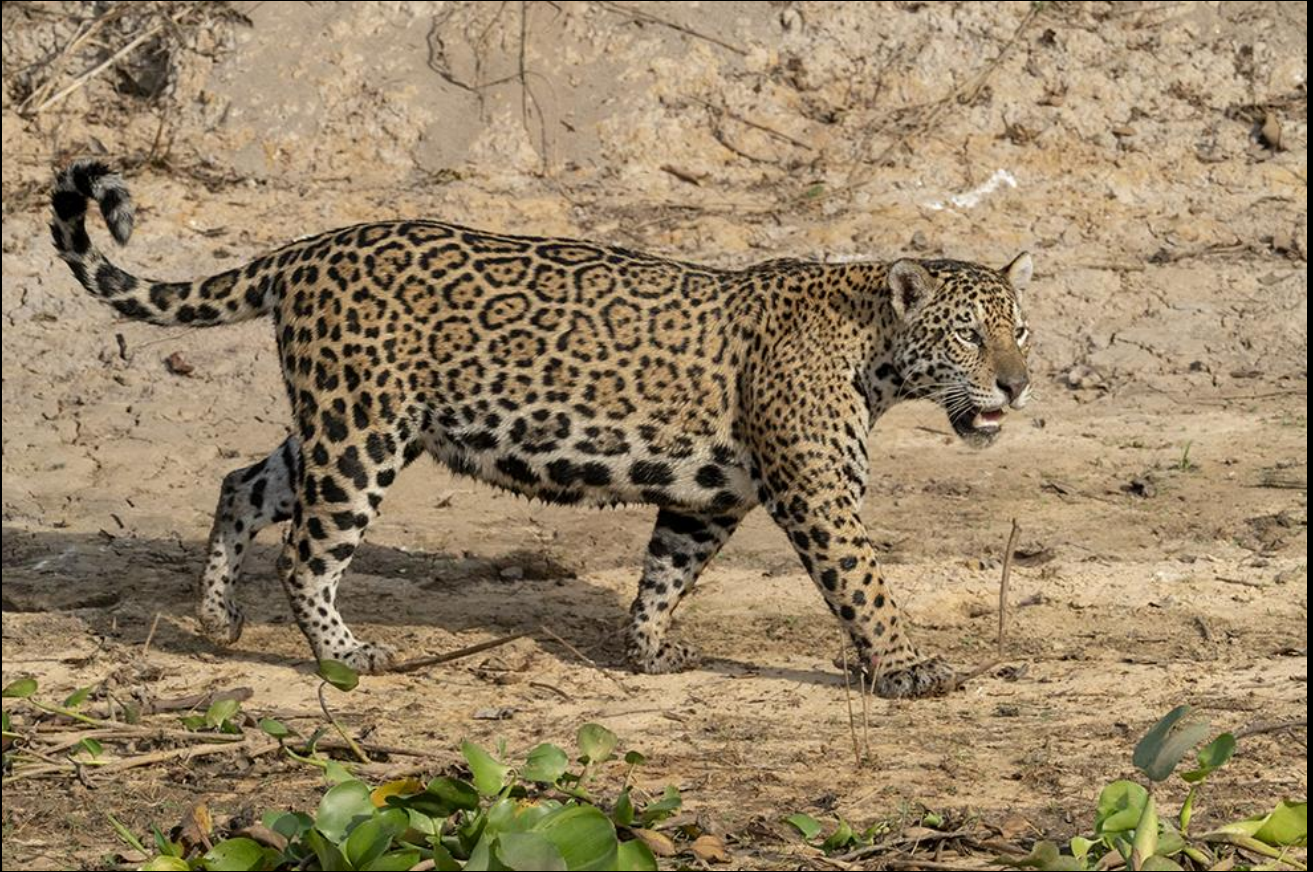
Three more individuals were seen during the next day. The one above was quite active and did several kill attempts on caimans and capybaras without success during the time we managed to watch it. The one below was more passive.