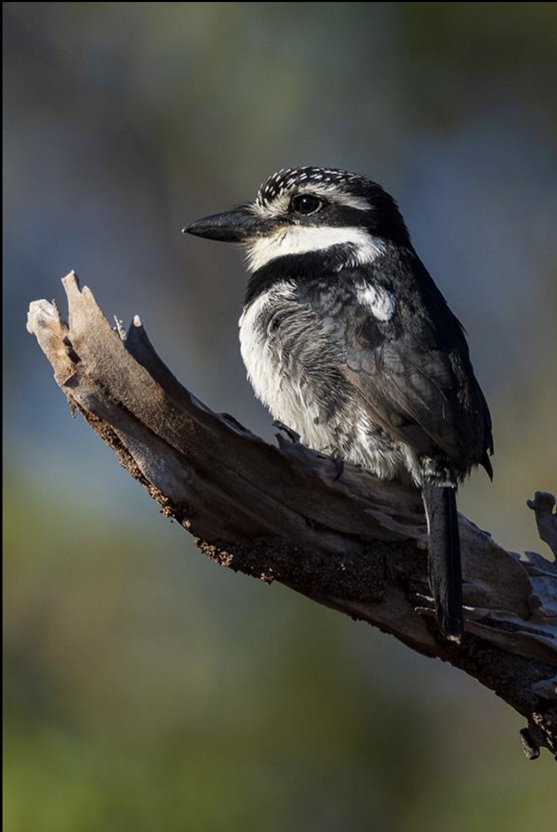
Pied Puffbirds are regular along the Serra trails in open areas. Normally in the canopy, this individual was for a change at eye-level and we did not complain about it.