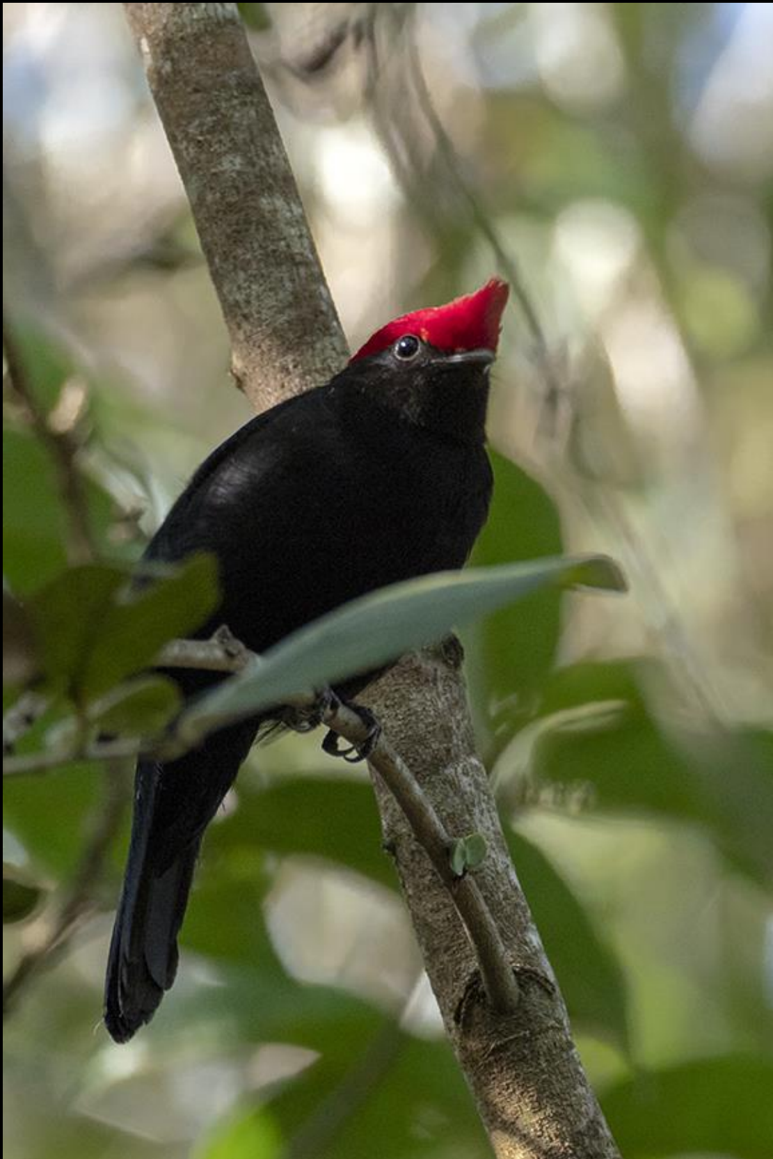
Gallery forests are also home to the sharp Helmeted Manakin, a bird that was a big target for most of the group. We had great views both in the Pantanal and previously in the Cerrado but the photo opportunities were only good the day we birded the rich patch of forest near Hotel Pantanal Mato Grosso that sits on the border of the Pixaim River.