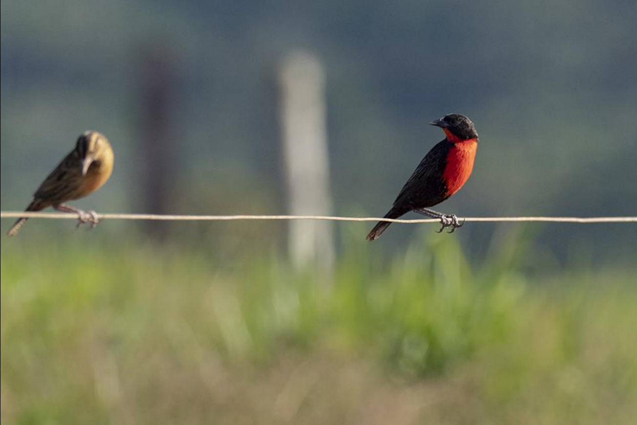
En route to Cristalino Jungle Lodge we stopped for these Red-breasted Meadowlarks (above and below)