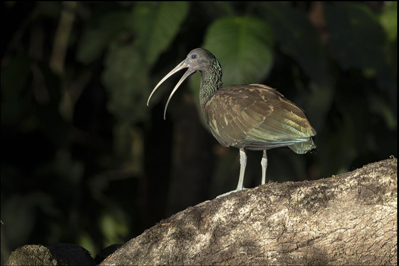
While riding motorized canoes along the Cristalino River we got great birds that posed quite well for photos. This was the case for this ghostly Green Ibis (above) and the elegant Sunbittern (below)