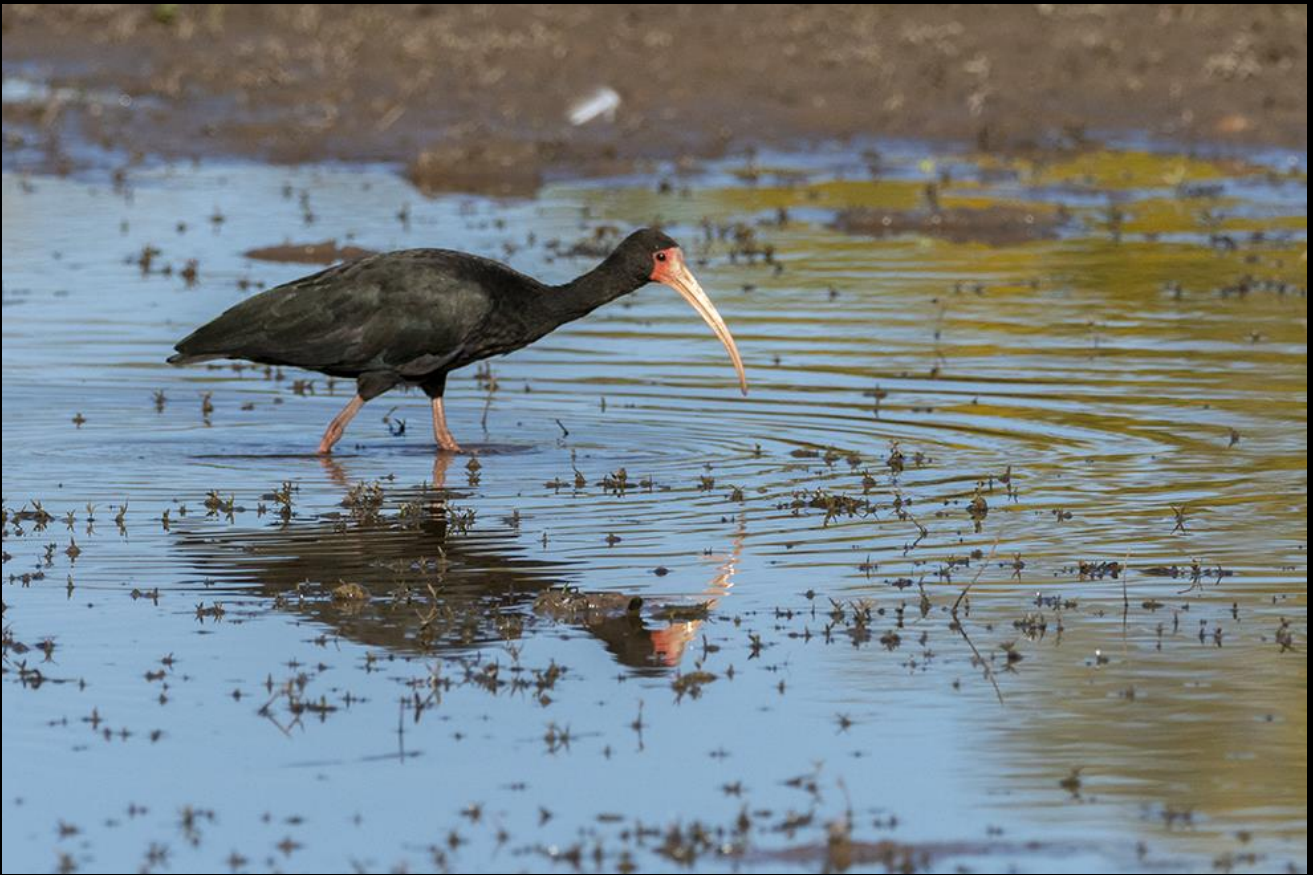
Driving near the shrinking ponds of Pousada Piuval we flushed a few Nacunda Nighthawks (below) and saw a ton of water related birds like this Bare-faced Ibis (above).