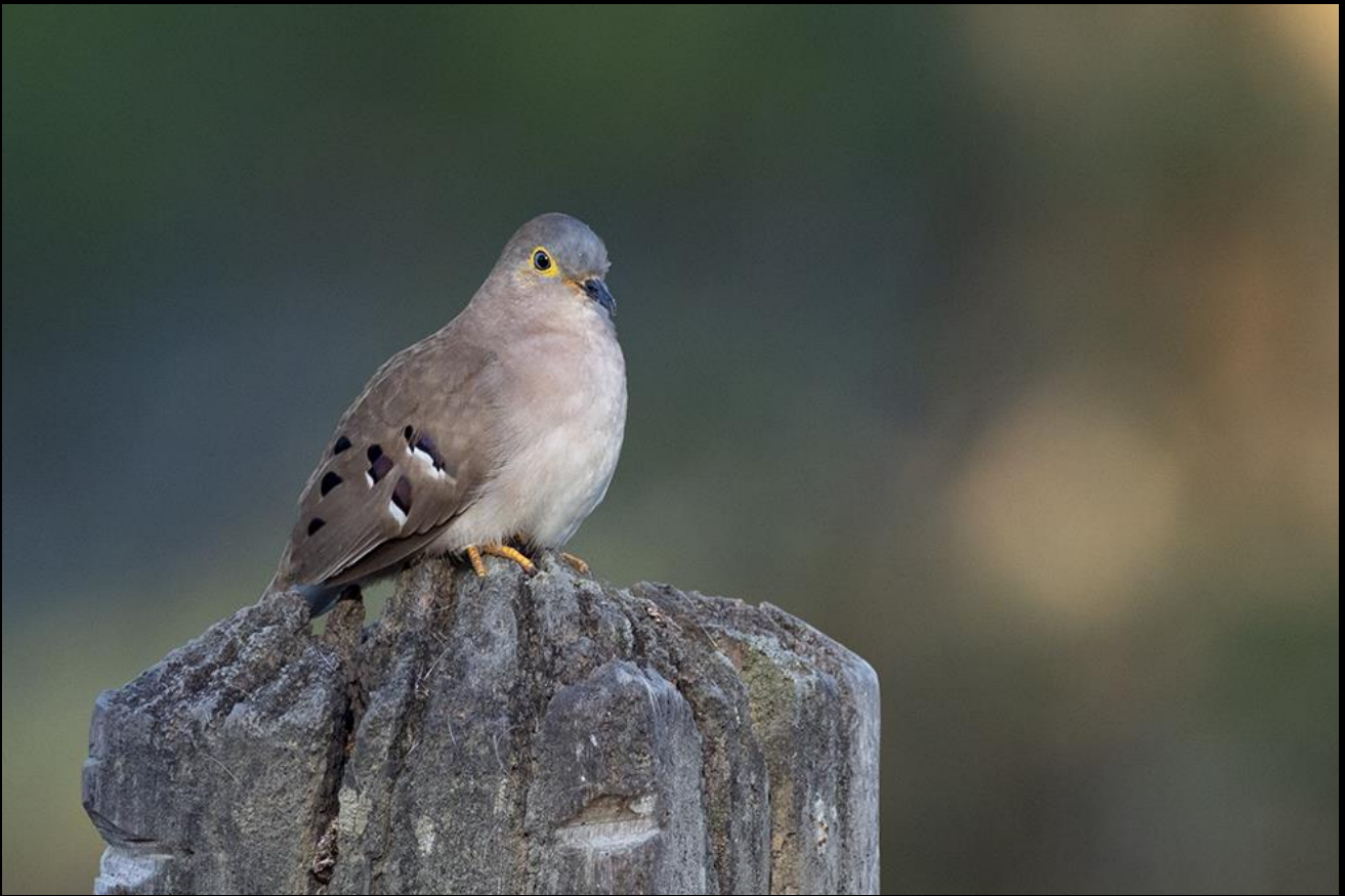
The stylish Long-tailed Ground-Dove above and two Buff-necked Ibis flying away close to dusk below