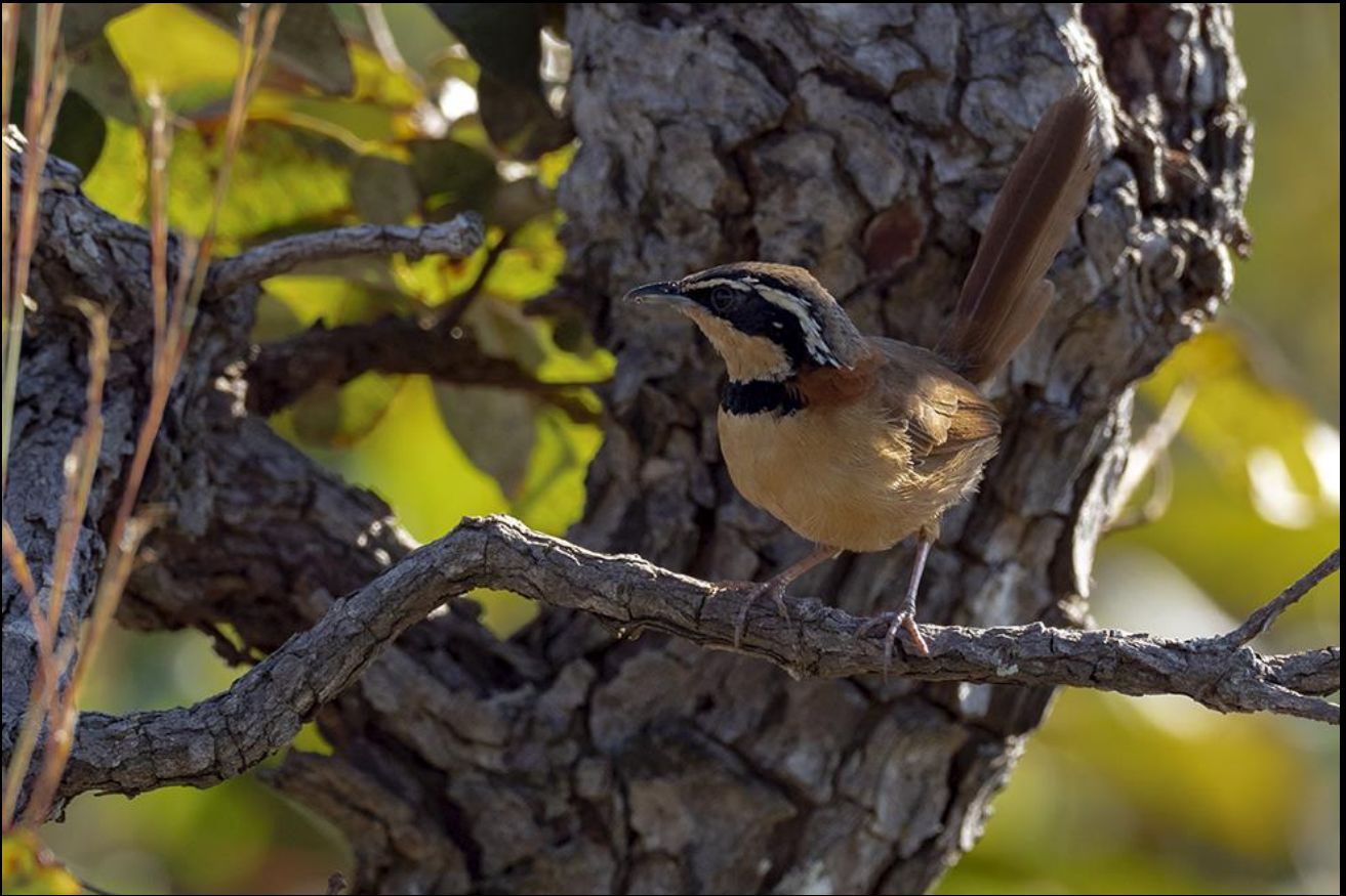
Another of the Crescentchest (above) ; and the not-easy -to-photograph Saffron-billed Sparrow