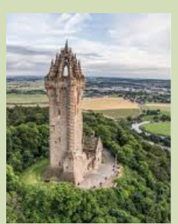
The National Wallace Monument, in memory of Sir William Wallace, is one of Scotland's most distinctive landmarks.

All admission prices included in your package!