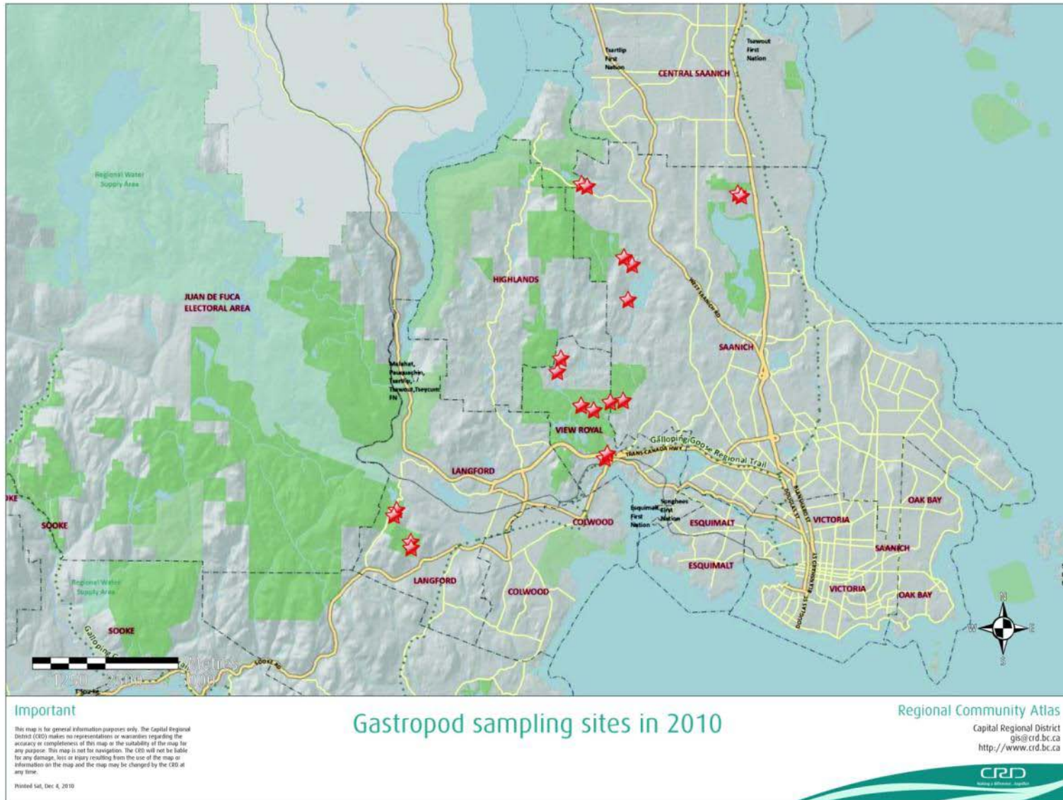
Figure 1. Overview of survey site locations in 2010 (indicated by red stars).