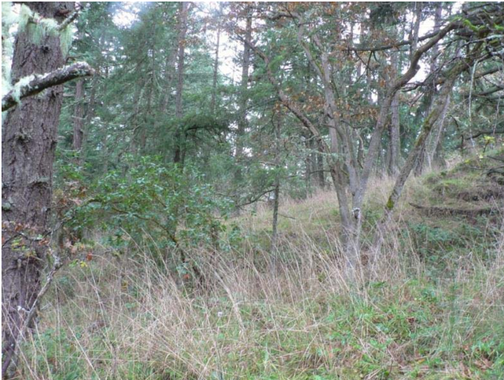
Plate 4. Blue-grey Taildropper habitat at the above site in Douglas-fir/arbutus/Garry oak woodland.