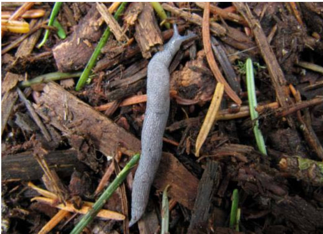
Plate 5. Blue-grey Taildropper crossing a trail in a Saanich municipal park (6 December 2010).