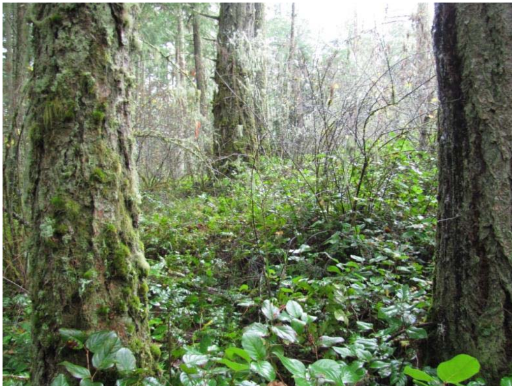
Plate 2. Blue-grey Taildropper habitat at the above site in Douglas-fir forest with dense shrubs at edge of open, rocky knoll.