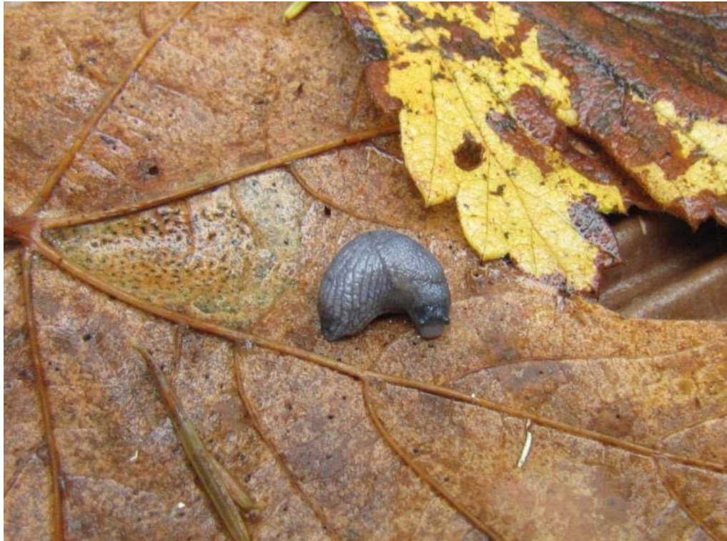
Plate 1. Blue-grey Taildropper found in a new area of Thetis Lake Regional Park (Transect 4, 13 Nov 2010).