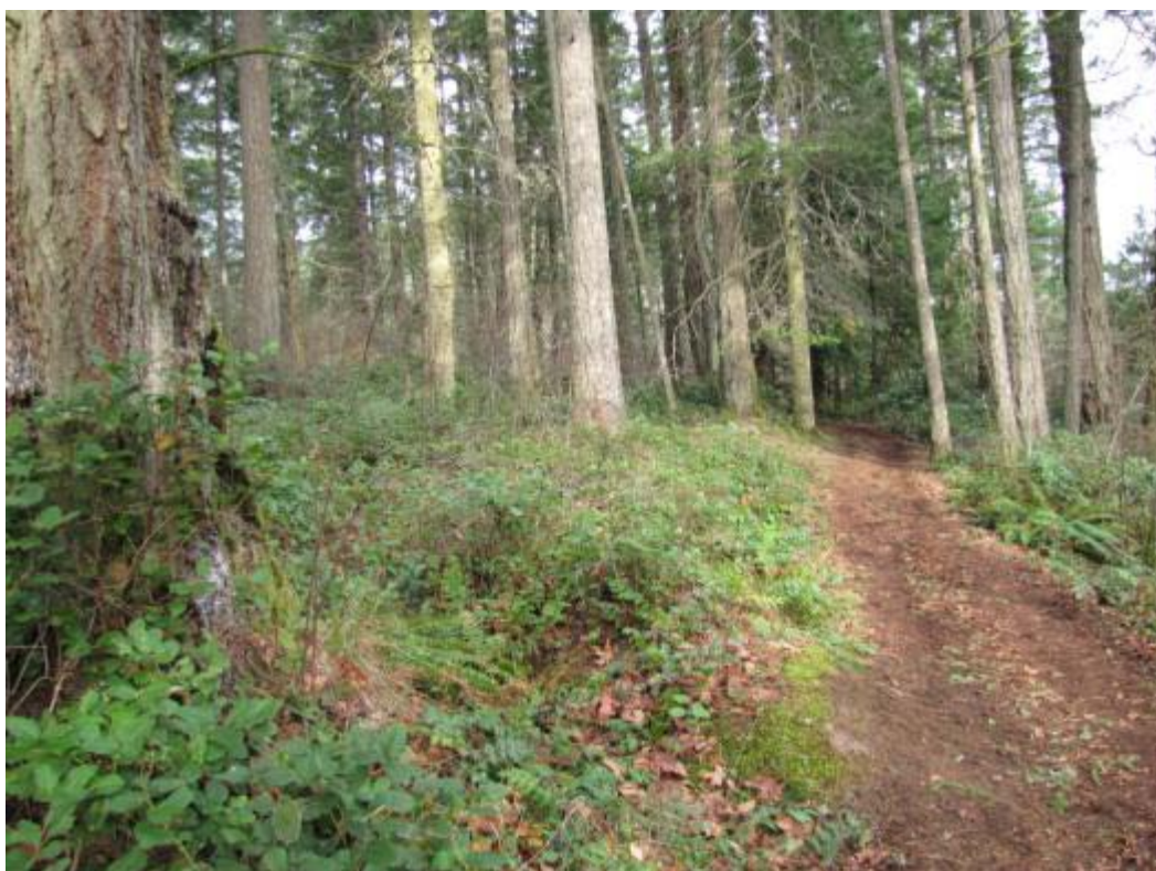
Plate 6. Blue-grey Taildropper habitat at the above site in a Douglas-fir stand with salal, Oregon grape, and sword fern in the understory.