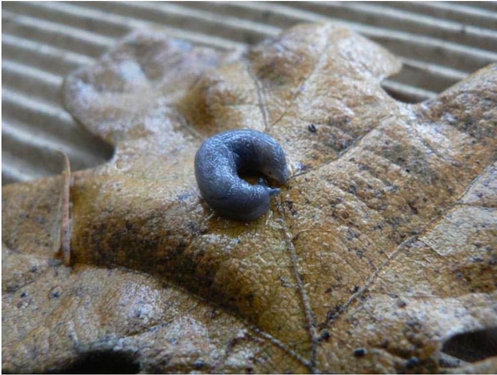
Plate 3. Blue-grey Taildropper found near previously known site in Thetis Lake Regional Park (Transect 7, 13 November 2010).