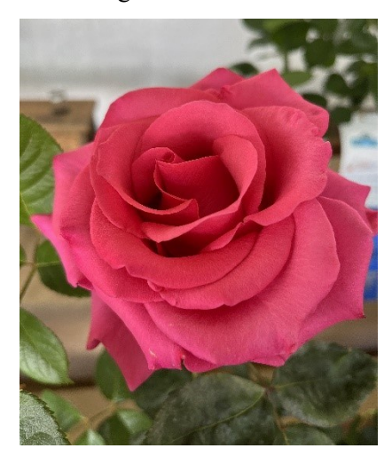
Clockwise from upper left: 'Hot Princess', 'Magic Carrousel', 'Gemini; ' Pink Promise'

become more vulnerable when exposed to prolonged heat (this is the time when chilli thrips can attack). You'll want to have beautiful blooms ready for the rose show at the end of the month. We are fortunate in Southern California to have the right kind of weather lengthening our rose growing season, so care for your roses by feeding and attending to them regularly which will bring you a couple more bloom cycles through fall and later. We try to keep our roses blooming into late November to have an arrangement on our table as our Thanksgiving centerpiece. Below are a few photos of roses from our garden.