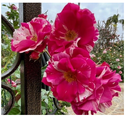
'Berries 'n' Cream' is a Poulsen 6– to 12-foot disease-resistant climber with fragrant repeat-blooming clusters of striped pink and cream flowers. It is sparsely prickled on the lower portion of its canes.

strong support and space for this over 15-foot thornless, vigorous and tenacious climber that bears prolific clusters of pink flowers especially in the spring. Warning: it does have prickles on the underside of its petioles.