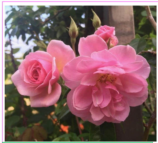
'Renae' is a Ralph More 8– to 10-foot climbing floribunda, has thornless pliable canes that bear fragrant clusters of small pink flow-

'Renae' (1954), a Ralph Moore 8- to 10-foot climbing floribunda, Renae has thornless pliable canes and fragrant, pale loosely double small pink flowers that bloom repeatedly in clusters.