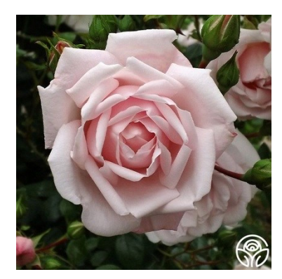
'Oueen Elizabeth', 'Silver Jubilee Rose', 'Special Occasion', 'Royal William', 'New Dawn', 'Rob Rov'