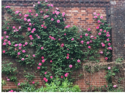
'Zéphirine Drouhin' is a completely thornless Bourbon climber. The bright cerise-pink ruffled flowers are richly fragrant with a damask scent.

'Zephirine Drouhin', (1868) is a completely thornless Bourbon climb-