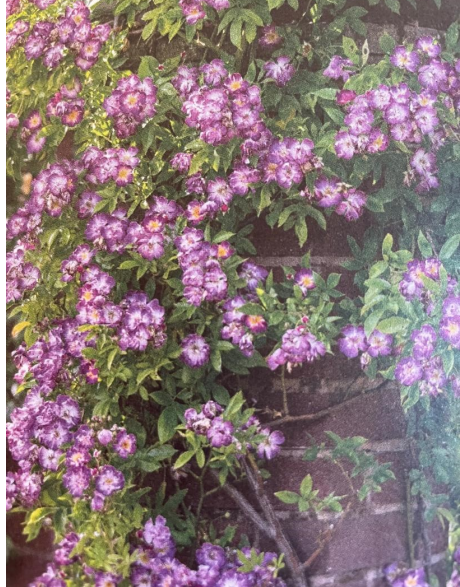
'Rosa Veilchenblau', an almost thornless once-flowering rambler produces clusters of small magenta cupped flowers with white centers and bright yellow stamens. The blooms have a strong fruity scent with notes of orange.

bloom repeatedly. Be warned, the underside of the petioles do have tiny but very sharp prickles.