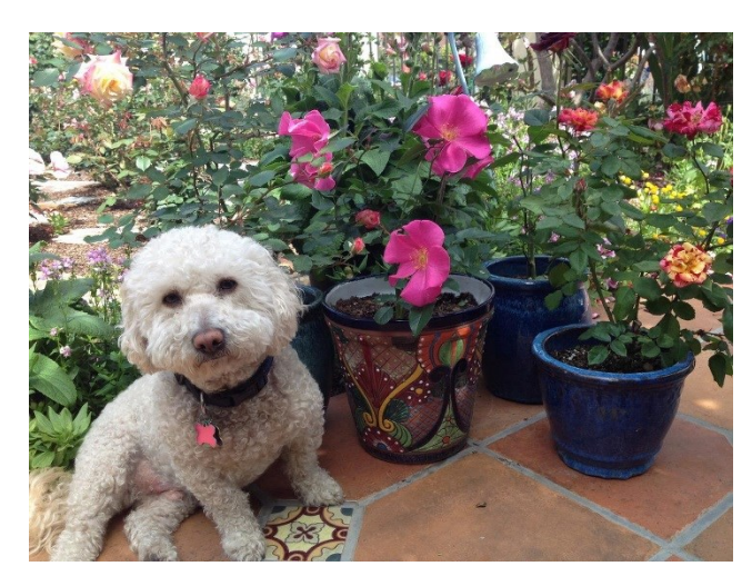
Above: In my garden my dog, Bowser, sitting next to container roses, magenta pink single-petal floribunda, 'Playgirl' and miniature rose, 'The Streak'.

In my garden, I find that most of my roses grow better when planted in the ground. Growing container roses is not complicated and they can be that bit of magic your garden needs. But they do need a gardener who is watchful and observant. It doesn't take a giant leap to go from fabulous container rose to dull and uninteresting potted plant.