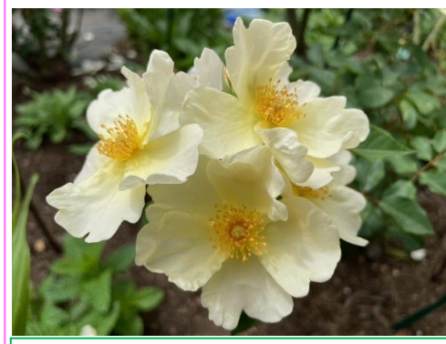
The David Austin website describes single petal rose 'Kew Gardens' as completely thornless but in California you may discover it has large sharp thorns on the base of its canes.

'Paul Neyron' (1869) is a pink, very free-flowering, highly scented large-flowered rose. Up to 6 feet high, it has very few thorns.