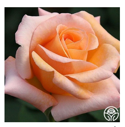
continued on page 18