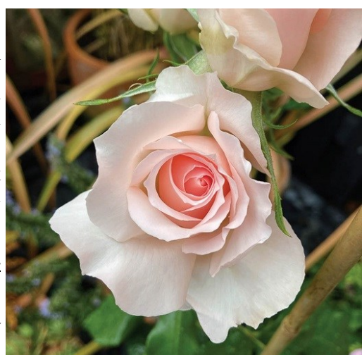
The Queen Elizabeth II Rose'

• 'Fairy Queen' (Fl 1971 Williams lp, 26-40 petals) bred from 'The Fairy' and 'Queen Elizabeth', can be ordered from Windmill Nursery in California. 'Fairy Queen's' blush pink and coral blooms have a strong fragrance.