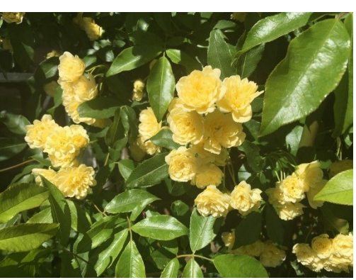
continued on page 14