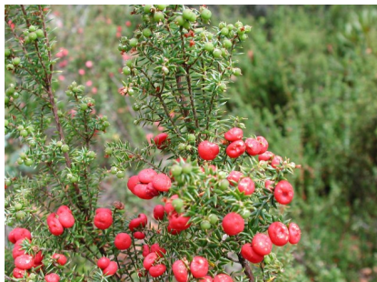
RW Leptecophylla parvifolia

blue bottledaisy rosette herb; leaves hairy, to 8cm long; single flower head white or purplish on long hairy stem