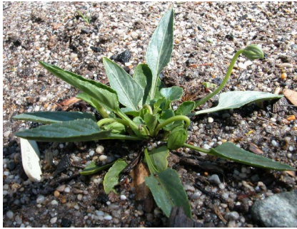
GJ Viola betonicifolia

slender speedwell herb to 10cm; leaves narrow lance-shaped, to 3.5cm; flowers blue, four petalled