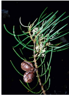
GJ Hakea lissosperma

trailing native-primrose prostrate herb; leaves to 7cm, dark green above lighter below; flowers golden, asymmetric on long stem