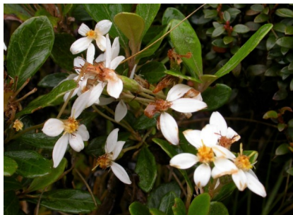
RS Olearia personioides

rock daisybush shrub to 60cm; leaves oblong to 3cm, folded down, hairy under; daisy flowers white