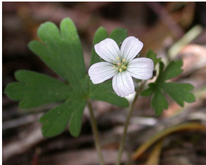
RW Geranium potentilloides

copperleaf snowberry shrub to 1m; leaves dark green, edges serrated; flowers urn shaped, white/pink; fruit white, fleshy