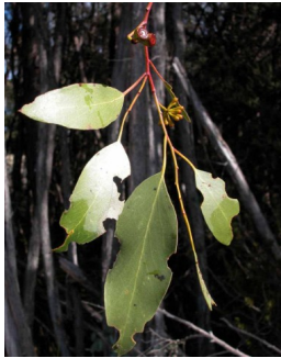
GJ Eucalyptus delegatensis

alpine cider gum small tree; trunk smooth above base; young leaves round adult leaves lance shaped; buds in 3's