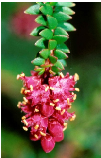
GJ Trochocarpa thymifolia

tree to 4m; leaves lance-shaped; flowers red, to 8cm diam; fruit a leathery pod