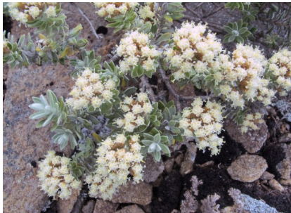
RS Ozothamnus rodwayi

sticky everlastingbush shrub to 1.5m; leaves lance-shaped, pale/waxy below, sticky, flowers clustered at ends of branches