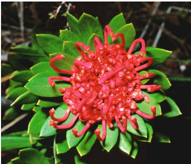
GJ Telopea truncata

tree to 5m; leaves lance-shaped on red stems; flowers yellow; fruit red turning black