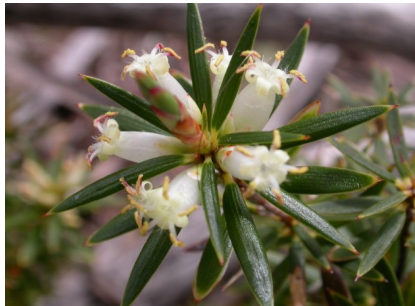
RS Cyathodes glauca

common billybuttons herb; tiny cream flowers in almost spherical heads;