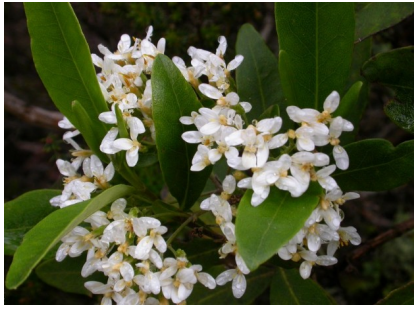
RS Olearia tasmanica

tasmanian daisybush shrub to 3m; leaves elliptical to 5cm, shiny above, white & hairy below; white daisy flower heads 3 to 5 on single stem