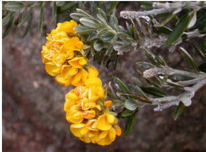
RS Oxylobium ellipticum

tasmanian daisybush shrub to 3m; leaves elliptical to 5cm, shiny above, white & hairy below; white daisy flower heads 3 to 5 on single stem