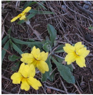
RS Goodenia lanata

trailing native-primrose prostrate herb; leaves to 7cm, dark green above lighter below; flowers golden, asymmetric on long stem