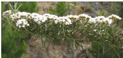
GJ Ozothamnus thyrsoides

alpine everlastingbush shrub to 1m; leaves to 1.5cm, grey-green, hairy/white below; flowers white, clustered at ends of branches