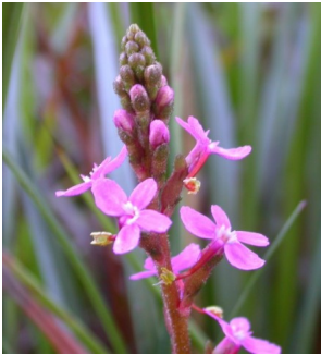
RS Stylidium graminifolium

herb to 50cm. several erect stems; leaves narrow; flowers white tubular in dense spikes at ends of stems.