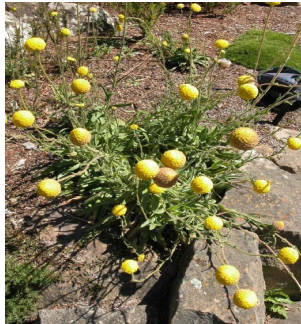
GJ Craspedia glauca

mountain currant shrub to 2m; leaves small elliptical; flowers small; fruit spherical, orange/red