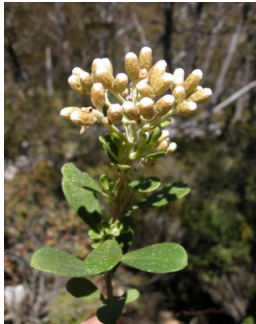
GJ Ozothamnus antennaria

golden shaggypea shrub to 2.5m leaves elliptical, grey or rusty below; golden pea flowers clustered at ends of branches