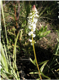
GJ Stackhousia monogyna