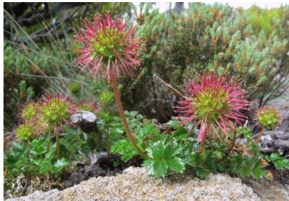
RS Acaena novae-zelandiae

common buzzy herb; leaves divided; balls of flower/seeds with hooks