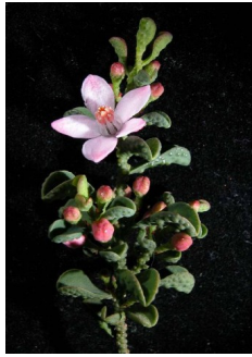
GJ Philothea verrucosa

fairy waxflower shrub; branches warty; profusion of white star-like flowers