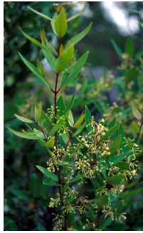
GJ Notelaea ligustrina

native olive small tree; leaves lance-shaped to 5cm; small green to purple fruit