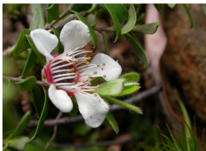
RS Leptospermum lanigerum

mountain pinkberry shrub to 1.2m; leaves narrow, sharp pointed, <7mm long; white tubular flowers at end of branch