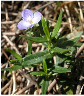
GJ Veronica gracilis

slender speedwell herb to 10cm; leaves narrow lance-shaped, to 3.5cm; flowers blue, four petalled