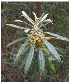
GJ Bedfordia salicina

wiry bushpea shrub to 90 cm; leaves oblong to 8 mm; yellow/orange pea flowers in bunches at ends of stems