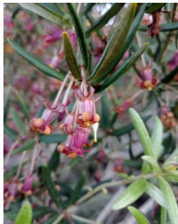
AS Pittosporum bicolor

bushmans bootlace shrub to 2m; leaves round, dark green, shiny above, white & hairy below; flowers tubular, in spherical heads