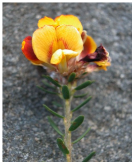
GJ Almaleea subumbellata

common buzzy herb; leaves divided; balls of flower/seeds with hooks