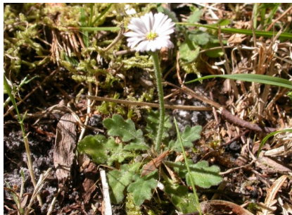
RS Lagenophora stipitata

mountain needlebush small tree to 6m; leaves cylindrical sharply pointed; flowers white; fruit almost round with short beak and warty surface