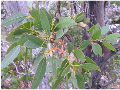
GJ Eucalyptus archeri

alpine cider gum small tree; trunk smooth above base; young leaves round adult leaves lance shaped; buds in 3's