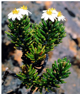
GJ Olearia ledifolia

myrtle beech tree to 50m; leaves roundish, new growth red; flowers inconspicuous