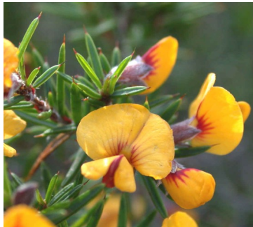
RW Pultenaea juniperina

cheesewood tree to 8m, conical habit; leaves dark green above, lighter below; flowers bell-shaped, brown & yellow