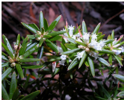
GJ Cyathodes straminea

purple cheeseberry shrub to 3m; leaves pointed, to 5cm, green above whitish below; flowers tubular, white; fruit fleshy, white to red