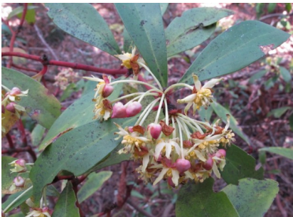
RS Tasmania lanceolata

herb to 50cm; leaves narrow, strap-like; flowers pink, four-petalled, in spikes