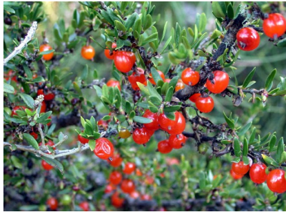
RW Coprosma nitida

spoonleaf daisy herb to 30cm; spatulate leaves; stem with single blue daisy flower