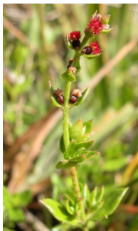
GJ Gonocarpus serpyllifolius

var. potentilloides mountain cranesbill herb; lobed leaves; pink flowers; "storksbill" fruit