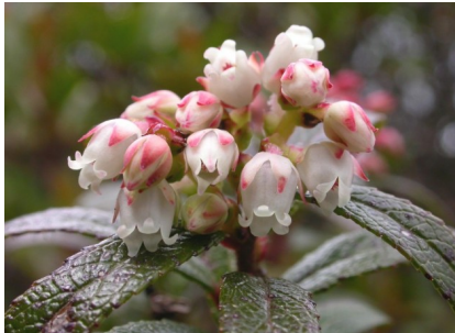
RS Gaultheria hispida

subsp. tasmaniensis gumtopped stringybark tree to 50m; stringy bark on most of trunk, branches white; leaves asymmetrical.