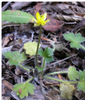
GJ Ranunculus lappaceus

prickly beauty shrub to 2.5m; leaves to 12mm, sharp pointed; golden pea flowers at ends of branches