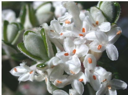
RW Pimelea nivea

fairy waxflower shrub; branches warty; profusion of white star-like flowers