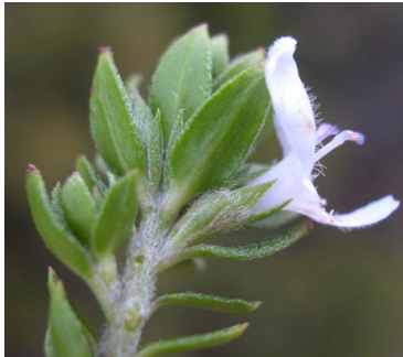
GJ Westringia rubiifolia

subsp. betonicifolia showy violet rosette herb to 6cm; leaves erect, lance-shaped; flowers violet on long stem