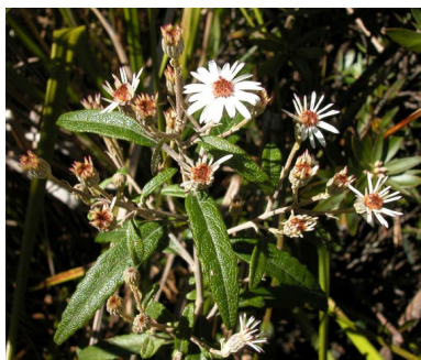
GJ Olearia phlogopappa

geebung daisybush shrub to 3m; leaves elliptical to 5cm, shiny above, hairy below; flower heads 3 to 5 on single stem