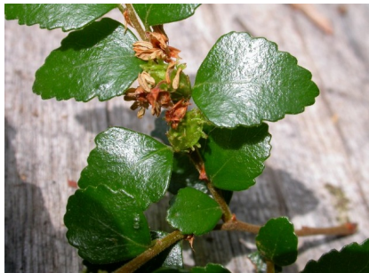
RS Nothofagus cunninghamii

native olive small tree; leaves lance-shaped to 5cm; small green to purple fruit