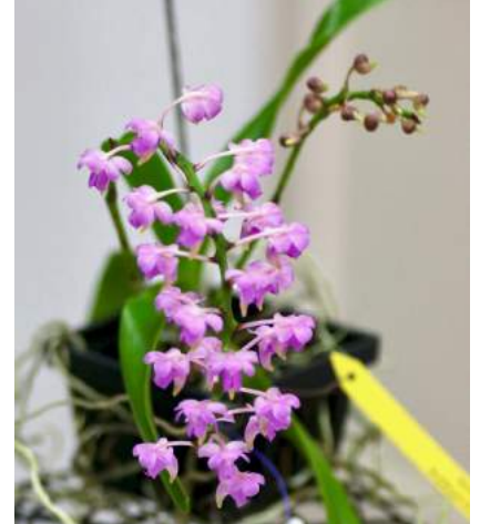
Aer. Quinquevulnera Gabrielle