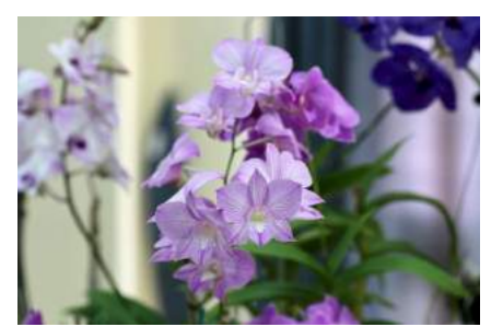
Den. Asternova - Nita