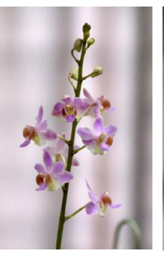
Phal. pulcherrima Gabrielle