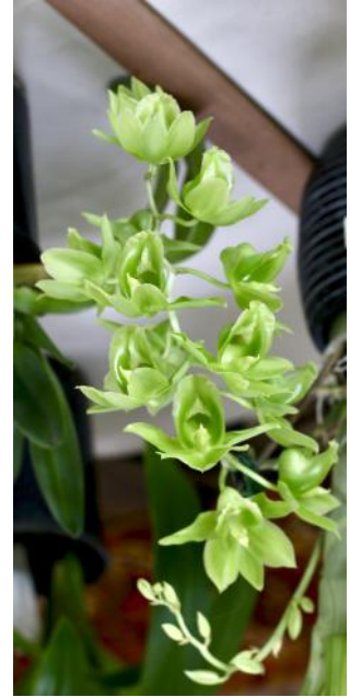
Ctsm. Black Jade Col & Bev