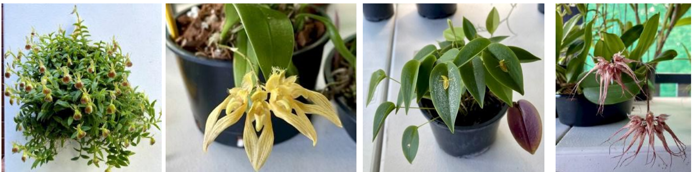
Photo's from Species Group