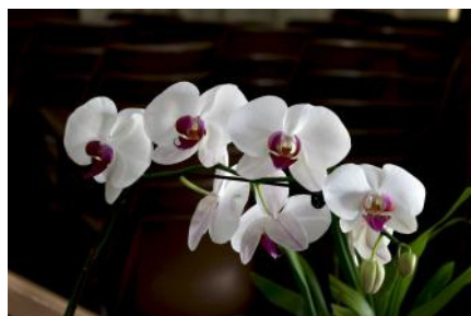
Phal. Unknown Col & Bev