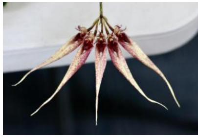
Bulb. Santa Claus x annandalei Duncan