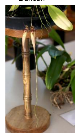
Bulb. Fascination - Luda