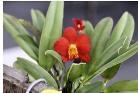
C. Chief Gem - Luda