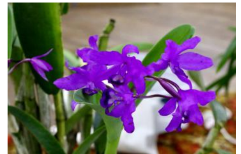
Gur. bowringiana - Duncan