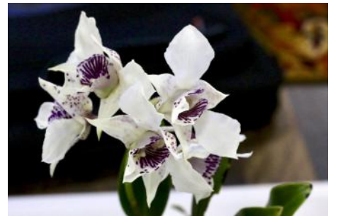
Den. Royal Wings - Lyn