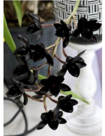
Fdk. After Dark - Luda