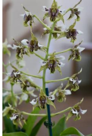
Den. (macrophllum x finisterrae) X shraishii - Don