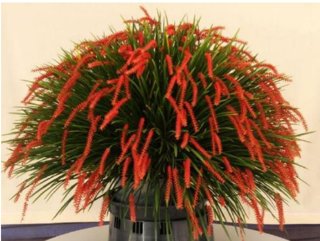
Dendrochilum wenzelii becomes Coelogyne wenzelii