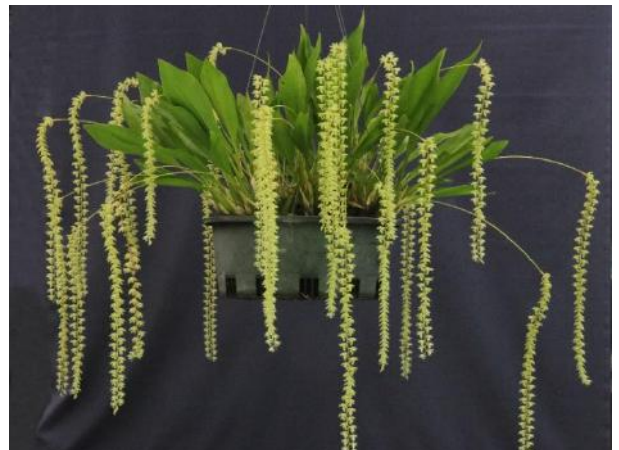
Dendrochilum cobbianum becomes Coelogyne cobbiana