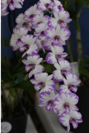
Den. Enobi Purple Tom