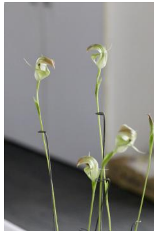
Pts. baptitii - Don