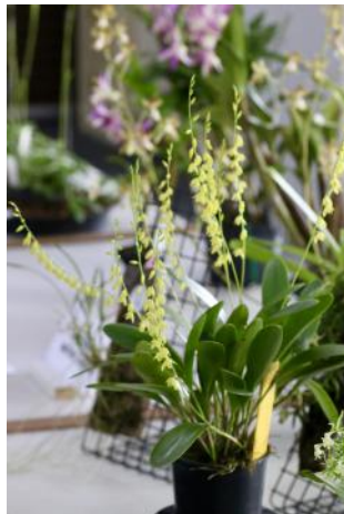
Stelis quadrifda