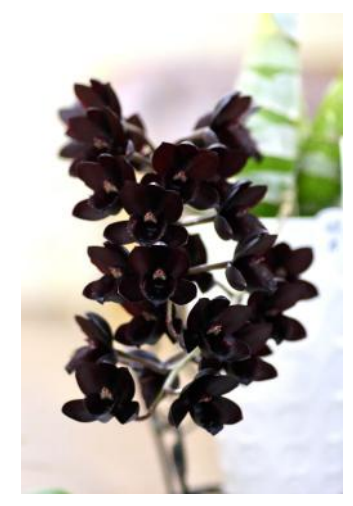
Fdk. After Dark - Luda