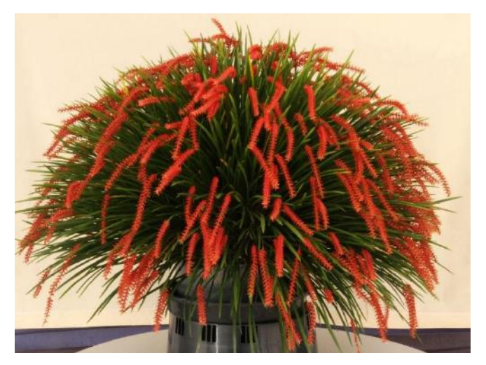
Dendrochilum wenzelii becombes Coelogyne wenzelii