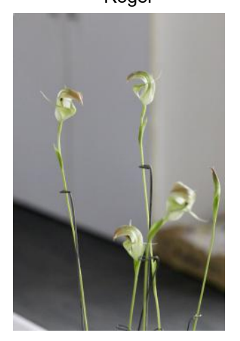
Pts. baptitii - Don