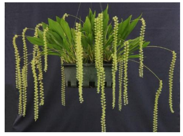
Dendrochilum cobbianum becomes Coelogyne cobbiana