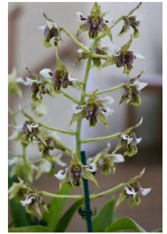
Den. Enobi Purple Tom Den. (macrophllum x finisterrae)