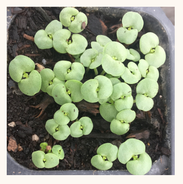
Here's kkaennip as they first emerge

March through May are good times to plant perilla. They are fairly frost-sensitive, so plan around your last frost date. You want to germinate them in early spring as the days lengthen and light begins to intensify. They should be well established by the summer solstice, hopefully having about 4 leaf sets. By your peak season, they should have nice, full canopies.