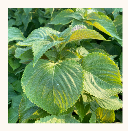
Kkaennip (leaf) 깻잎 (Korean) Deulkkae (seed) 둘깨 (Korean) Egoma えごま (Japanese) Baisu (Chinese) Thoiding (Manipuri) Kenie (Naga) Perilla frutescens var. frutescens