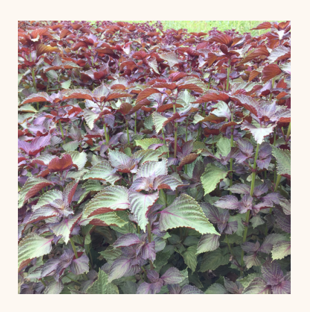
Cha Jogi 차조기 (Korean) Cha Soyeop 차소엽 (Korean) Aka shiso 赤紫蘇 (Japanese) Zisu 紫蘇 (Chinese) Perilla frutescens var. acuta