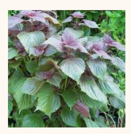
Lá tía tô (Vietnamese) Chungsoyeop 충소엽 (Korean) Katamen Shiso 片面紫蘇 (Japanese) Perilla frutescens var. crispa f. viridis