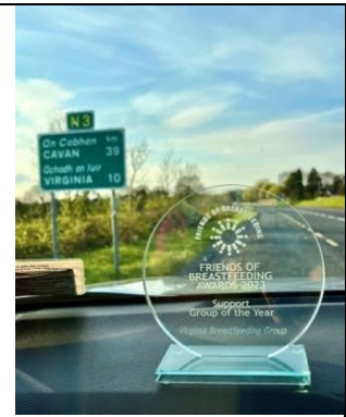
And-the award goes to VIRGINIA