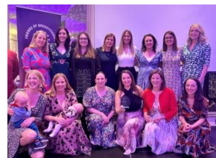
A group of very PROUD mammies.