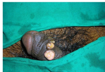
Figure 1: Discrete, Contiguous skin coloured verrucous nodule

in the upper stratum spinosum and granular layer (figure 2). Based on the clinicopathological correlation final diagnosis of epidermolytic acanthosis was arrived.