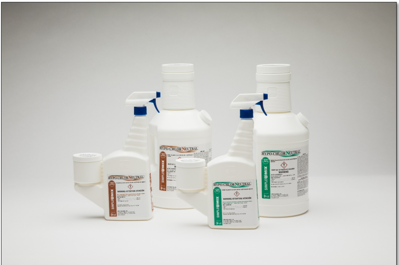
HYPO-CHLOR Neutral Family of Products

(Any specific product label is available upon request.)