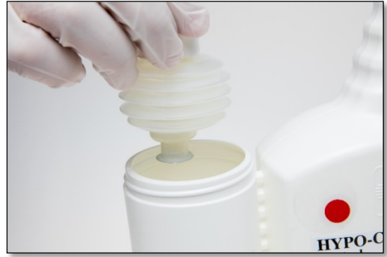
SimpleMix Bottle with Activator

HYPO-CHLOR Neutral 0.25% and 0.52% are activated via the SimpleMix System by neutralizing the pH. The activator is housed in the small chamber suspended above the sodium hypochlorite solution in the large chamber below. Once the SimpleMix plunger is pushed, the activator is mixed into the solution following the SimpleMix directions. Testing has shown that HYPO-CHLOR Neutral Products are effective as neutralized cleaners for up to 24 hours post activation.