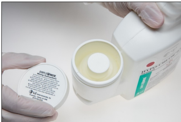
473 mL SimpleMix Bottle

Veltek Associates, Inc. has developed the patented SimpleMix System Technology to eliminate measuring and additional containers. It provides for the transfer of the sterile concentrated disinfectant, sporicide, or activating agent, and sterile water in a sealed container to the aseptic area. The system container is double bag packaged for easy transfer and eliminates all internal and external sterility concerns. The patented SimpleMix System 3.79 Liter, 473 mL, and 200L systems provide a sealed multi-chamber container that when activated mixes the solution to the correct use dilution. The opening on the top of the 3.79 Liter size contains the concentrate and the bottom reservoir contains the VAI WFI Quality Water or Sodium Hypochlorite Solution. The 473 mL side container houses the concentrate and the bottom reservoir houses the VAI WFI Quality Water or Sodium Hypochlorite Solution. Just open the small chamber cap, push the plunger container completely down until the bottom pops open and the bellows are compressed. 200L SimpleMix systems are activated through a hose and valve system connecting the cubicontainer of concentrate to the VAI WFI Quality Water or Sodium Hypochlorite solution. The system design permits the easy transfer of the product to the aseptic manufacturing area without concern for the transfer of contamination.