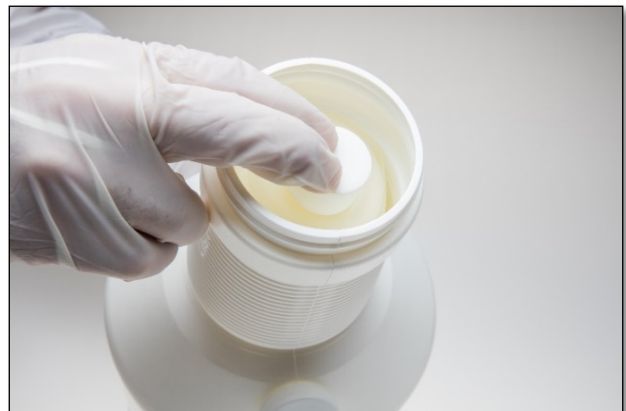
3.79 Liter SimpleMix Bottle