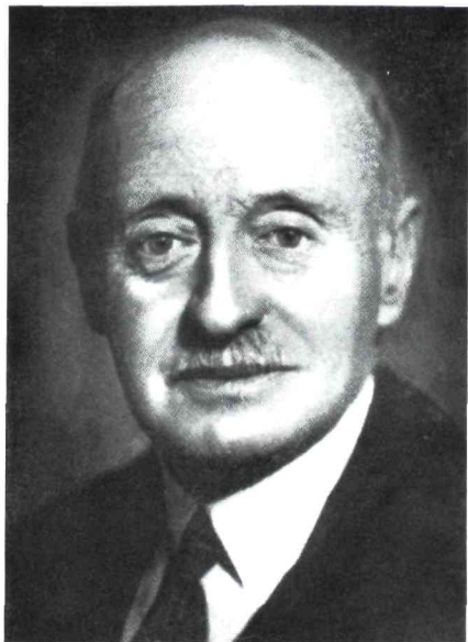
Comte Henri de Baillet-Latour President 1925-1941