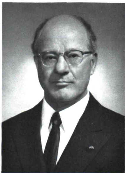
Avery Brundage President 1952-