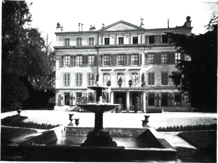
Campagne Mon-Repos. Lausanne Seat of the International Olympic Committee