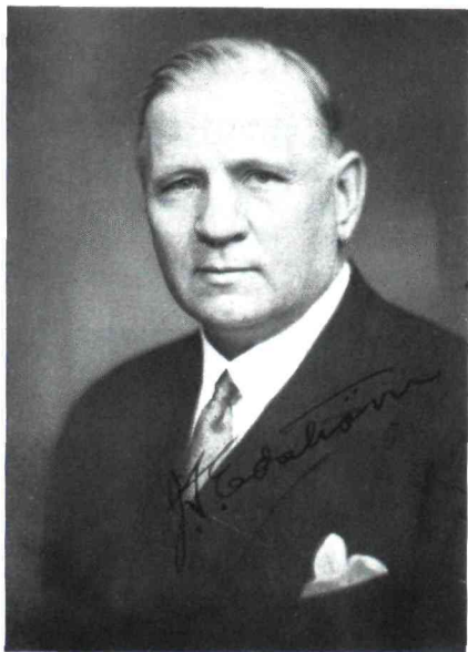
J. Sigfrid Edström President 1946-1952