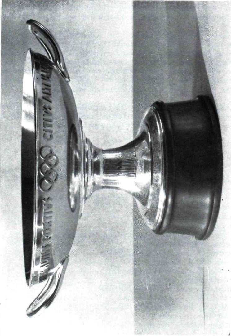
Sir Thomas Fearnley Cup