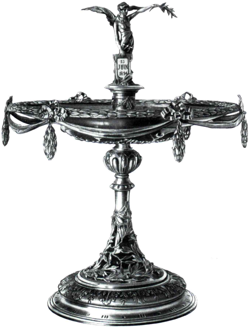
The Olympic Cup