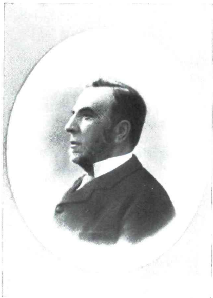
Demetrius Vikelas President 1894-1896