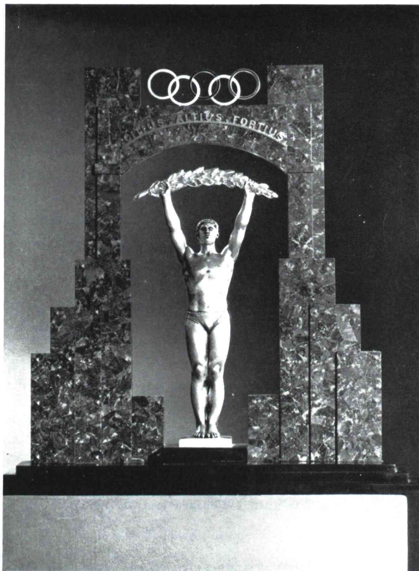
Mohammed Taher Trophy