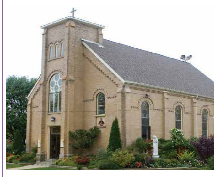
Church: 140 West Avenue