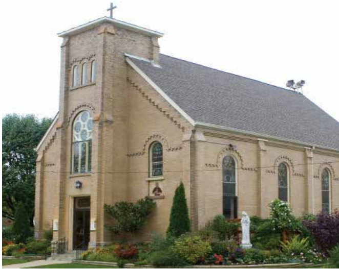
Church: 140 West Avenue