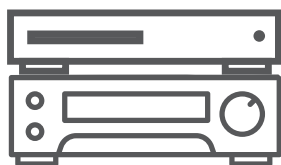
Supports various A/V devices