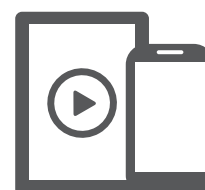
Watch on mobile devices