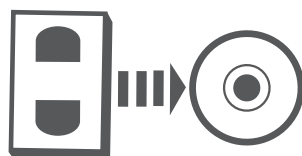
Converts VHS to DVD/VCD