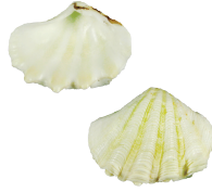
CARDIIDAE Tridacna crocea