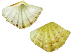
CARDIIDAE Hippopus cf. H. hippopus