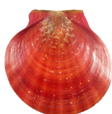
PROPEAMUSSIIDAE Amusium obliteratum