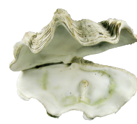
CARDIIDAE Tridacna squamosa