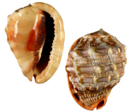
CASSIDAE Cypraecassis rufa