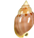
CASSIDAE Semicassis glabrata