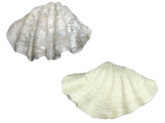
CARDIIDAE Tridacna gigas