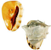
CASSIDAE Cassis cornuta