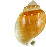
CASSIDAE Echinophoria wyvillei