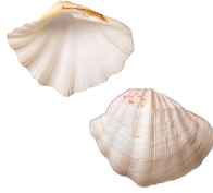
CARDIIDAE Hippopus porcellanus