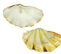
CARDIIDAE Tridacna maxima