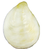
HIPPONICIDAE Hipponix lissus