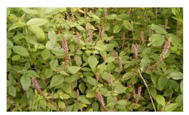
Fig. No. 8: Achyranthes aspera linn.

activity of aqueous and alcoholic extracts of Achyranthes aspera leaves was investigated in rats.<sup>[5]</sup>