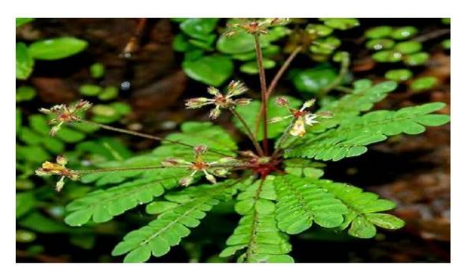
Fig. No. 10: Biophytum sensitivum linn.

of Biophytum sensitivum against zinc disc implantation-induced urolithiasis in rats was investigated.<sup>[12]</sup>