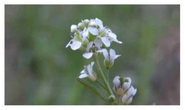
Fig. No. 7: Lepidium sativum.

It sometimes known as Garden Cress. It is a fast growing erect glabrous annual herb found primarily in the Karnataka districts of Bangalore and Kolar. Rats were given aqueous and methanolic extracts of L. sativum garden grass to test their<sup>[8]</sup> diuretic efficacy. As a positive control, hydrochlorothiazide was used. Urine volume and salt content rose after administration of both aqueous and methanolic extracts, whereas potassium excretion was raised only by the aqueous extract. The diuretic impact was comparable to that of hydrochlorothiazide, and methanol extract offers the added benefit of potassium conservation.<sup>[11]</sup>