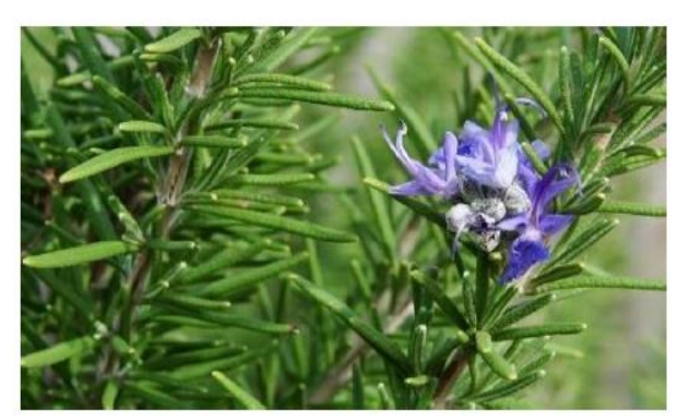
Fig. No. 3: Rosmarinus officinalis.

It is known as rosemary. It is used as a folk medicine to treat urinary problems. Its decoction is used in traditional medicine to treat urinary retention as a diuretic. It contains triterpenoids, volatile oil, caffeic acids, rosmarinic acids, and chlorogenic acids. Because triterpenoid and rosmarinic acids are associated with diuretic effect, the presence of these components qualifies it as a diuretic.<sup>[8]</sup>