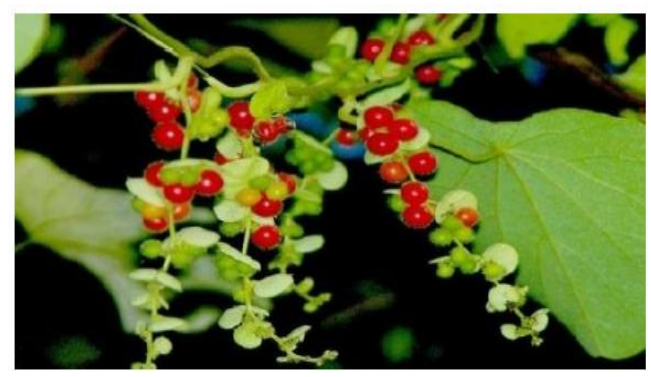
Fig. No. 4: Cissampelos pareira linn.