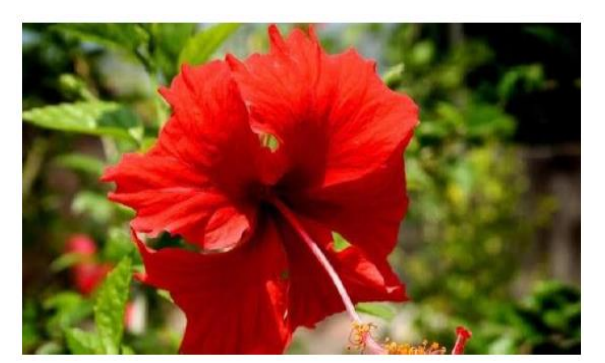
Fig. No. 5: Hibiscus sabdariffa.

It is reported to have diuretic and antipyretic properties. The leaves were diuretic, emollient, sedative, and refrigerant. The blooms include gossypetin, glycoside hibiscin, and anthocyanin. These have diuretic effects, lowering blood viscosity and blood pressure.<sup>[10]</sup>