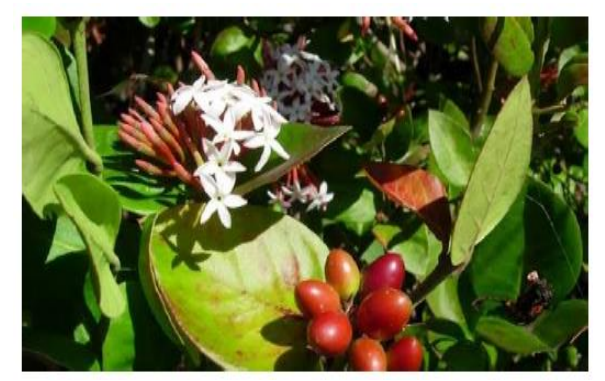
Fig. No. 12: Carissa edulis.