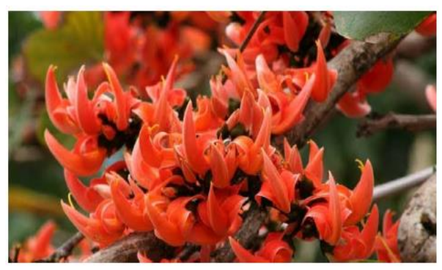
Fig. No. 9: Butea monosperma lam.

Butea monosperma aqueous and alcoholic extracts Flowers were examined in rats for diuretic action. This study looked at the effect of aqueous extracts of dried seeds powder from Butea Monosperma and Nigella Sativa plants on Ethylene glycol-induced renal calculi in albino wistar rats.<sup>[5]</sup>