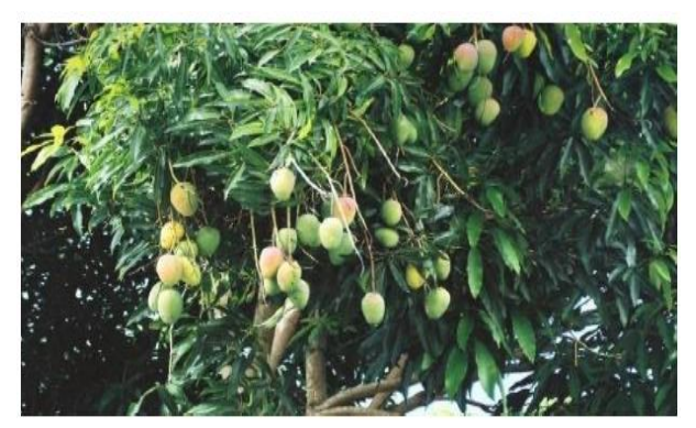
Fig. No. 1: Mangifera indica.

It is found in the wild in India, and cultivated forms have been brought to various warm regions of the world. It is the world's largest fruit tree, reaching a height of one hundred feet with a circumference of twelve to fourteen feet, sometimes surpassing twenty .Shree devi investigated the diuretic effect of Mangifera indica bark extract in rats. They test the diuretic efficacy of Mangifera indica extracts in ethyl acetate, ethanol, and water. The diuretic effect was tested in rats (175-200 kg body weight) by monitoring urine volume at 1, 2, 4, 6, and 24 hours. Furosemide (20mg/kg) i.p. and mannitol (100mg/kg) i.v. were used as positive controls. The extract was given orally at a dose of 250 mg/kg body weight. A diuretic investigation found that the aqueous extract had the highest Na+/K+ ratio, followed by ethanol and ethyl acetate extracts. When compared to other extracts, aqueous extracts have the best diuretic efficacy.<sup>[2]</sup>