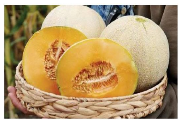
Fig. No. 6: Curcumis melo.