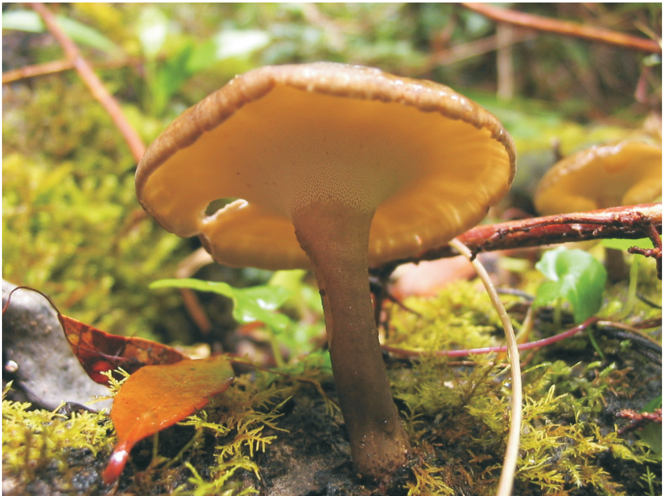
Polyporus sp. at the Quetzales trail in the Volcán Barú National Park, Panamá

Revista Científica de la Universidad Autónoma de Chiriquí en Panamá