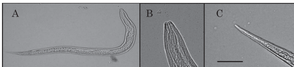
Figure 3. Nematode larva (A) recovered from a terrestrial snail showing a close-up view of the head (B) and tail (C). Bar indicates 160 \mu\text{m} .