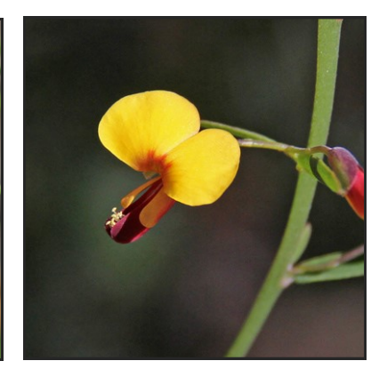
Leaves and flowers