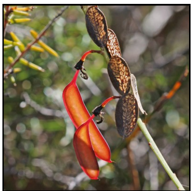
Immature fruits and skeleton leaves