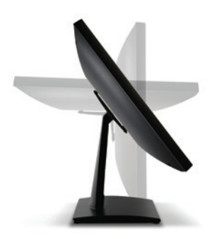
90-degrees of Adjustment