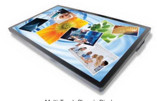
Multi-Touch Chassis Displays