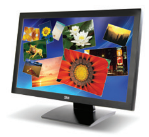
Multi-Touch Desktop Displays

3M combines its industry-leading multi-touch technology that delivers an ultra-fast, accurate, and precise multi-touch response, with a high-definition, wide viewing angle LCD, to create a multi-touch chassis for your next generation interactive application. The rugged all steel frame and a highly durable glass front surface provide the durability needed for demanding public use environment.