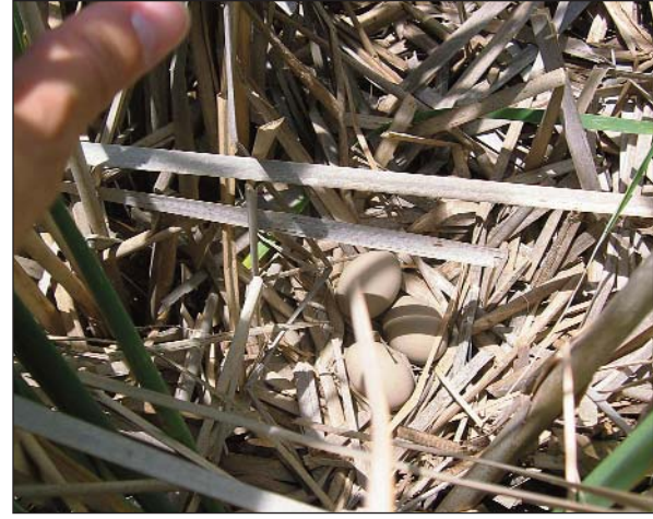
This American Bittern nest in Harper County is one of very few nest records in Oklahoma.

Well, I think I've already surpassed the page limit so I had better wrap it up. As you can see, this project is full of excitement and lots of new and interesting information. The goal is to continue to expand the number of marshes and keep moving east. I still have a few personal goals to reach and records to make, such as a Black Rail nest (which I now refer to as my Holy Grail). It would be very important to try and locate more American Bittern nests in the Northwest, and I'm well on the way of proving a range expansion for breeding Virginia Rails. Before I finish, I need to thank the Sutton Center once again. Their support of this project is what made it such a success, even though the weather became a factor. Their staff continues to help me in many ways and I hope that one day I can return that support in some manner. Thanks again.