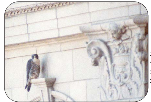
M. Alan Jenkins

Above: An adult male Peregrine Falcon trapped, banded and released during fall migration on the Texas Gulf Coast. Below: An adult female Peregrine Falcon perches on the facade of the Mayo Hotel in downtown Tulsa, OK.