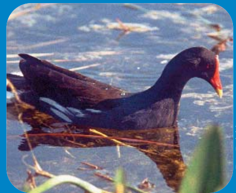
The Purple Gallinule (above) and Common Moorhen (below) are rare and locally breeding marsh birds in Oklahoma. Both can be seen at Red Slough in southeastern Oklahoma. Note the gallinule’s very elongated toes which help it walk on floating lily pads.