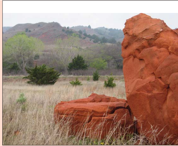
Plans are underway for a visitor's center and more public access to this rugged and scenic preserve.

Thirteen new species were added to our 2005 survey results this year. These included four species associated with water: Wood Duck, Double-crested Cormorant, Great Blue Heron, and Sandhill Crane; four landbird species with the potential to nest on the preserve: Common Poorwill, House Wren, Yellow Warbler, and Baltimore Oriole; two spring landbird migrants utilizing the preserve as a stopover site: Least Flycatcher and Clay-colored Sparrow; and three species that may have wintered on the preserve and were detected on early spring visits: Townsend's Solitaire, LeConte's Sparrow, and Brewer's Blackbird.